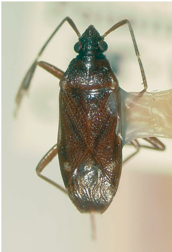
Fig. 1: Dorsal view, holotype Bubaces heissi nov.sp., Total length 5 mm.

are most often collected at lights or in light traps, these hairs are usually rubbed off.