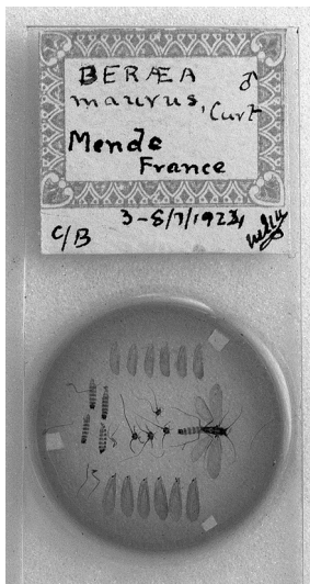
Fig. 4: Typical label from a Mosely slide preparation.

Europe. As well as being an impressively comprehensive collection of pinned specimens it also included many hundreds of meticulously prepared microscope slides. Mosely's slides are easily recognised by their distinctive labels: in the example illustrated here (Fig. 4) his initials "MEM" appear in the bottom right-hand corner and the letters C/B in the left-hand corner refer to the mountant, Canada Balsam. He described the detailed methods for making these slide mounts in one of his later papers (MOSELY 1943). His collection also included many hundreds of specimens preserved in fluid, and a small display cabinet of fluid-preserved freshwater insect larvae and other invertebrates, sealed into glass blocks, very similar to the collection in the Flyfishers' Club (Fig. 5). This may be the "collection of the food organisms eaten by trout" that was described as being on exhibition for many years at the BMNH (ANONYMOUS 1949).