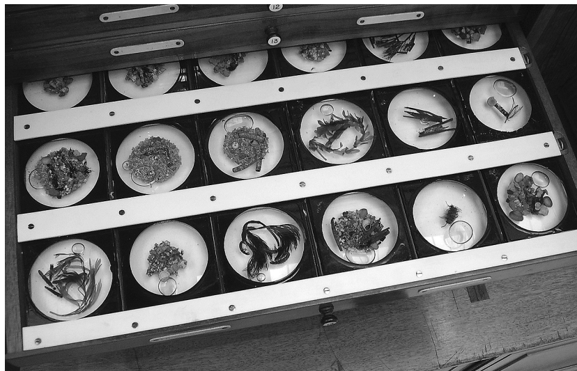
Fig. 5: Drawer from a display cabinet of freshwater invertebrates prepared by M.E. Mosely.

Summing up such a unique and enigmatic man as Mosely is difficult, and one can do no better than to quote from Riley's Introduction to The British Caddis Flies (MOSELY 1939): "It is impossible to say of Mr. Mosely whether the fisherman gave birth to the trichopterist or vice versa . The union has, however, proved an unusually fertile one."