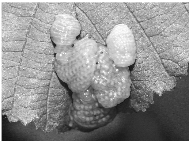
Fig. 1: Five egg masses of Glyptotaelius pellucidus on a leaf of grey alder ( Alnus incana ). The upper left egg mass was less than twelve hours old.

The main study area was the south shore of the lake Valasjön in Central Sweden (63°00'N/17°30'E). The study of egg-laying and egg masses was mainly carried out in 1988, 1989 and 1991. From egg masses taken in August 1990 larvae were reared to adults in the laboratory in the autumn 1990 and spring 1991. Adults emerged from December to January were transferred to small plastic cages (8 dm 3 ). Some of the females were dissected for examination of ovarian maturation. A few females oviposited in the cages and their egg masses were used for rearing larvae to adults.