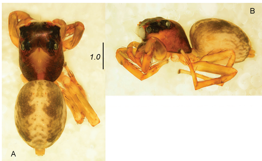
Fig. 4. Thiratoscirtus lamboji sp. nov., holotype, female. A. General appearance, dorsal view. B. General appearance, lateral view. Scale bar for all figures = 1 mm.

General appearance as in Fig. 4A–B. Carapace oval, high, sloping abruptly behind eye field, fovea sulciform. Distance between anterior lateral eyes slightly larger than between posterior laterals, eye field black, iridescent. Thoracic part greyish brown, foveal area yellowish, yellow streak extending to posterior edge of carapace. Carapace clothed in short light hairs, denser in anterior part of eye field, hairs form small patch between anterior median eyes. Reddish fawn hairs surround anterior eyes from above and form patches between median and lateral anterior eyes. Large red patches laterally from eyes of the last row made by the same hairs. Clypeus moderately high, dark. Chelicerae with two teeth on promargin and single larger tooth on retromargin, dorsal surface of chelicerae blackish. Mouth parts brown, sternum yellow. Abdomen oval, slightly swollen, greyish brown with broad serrated median streak, abdominal sides yellow marked with grey, venter whitish yellow. Dorsal surface covered with