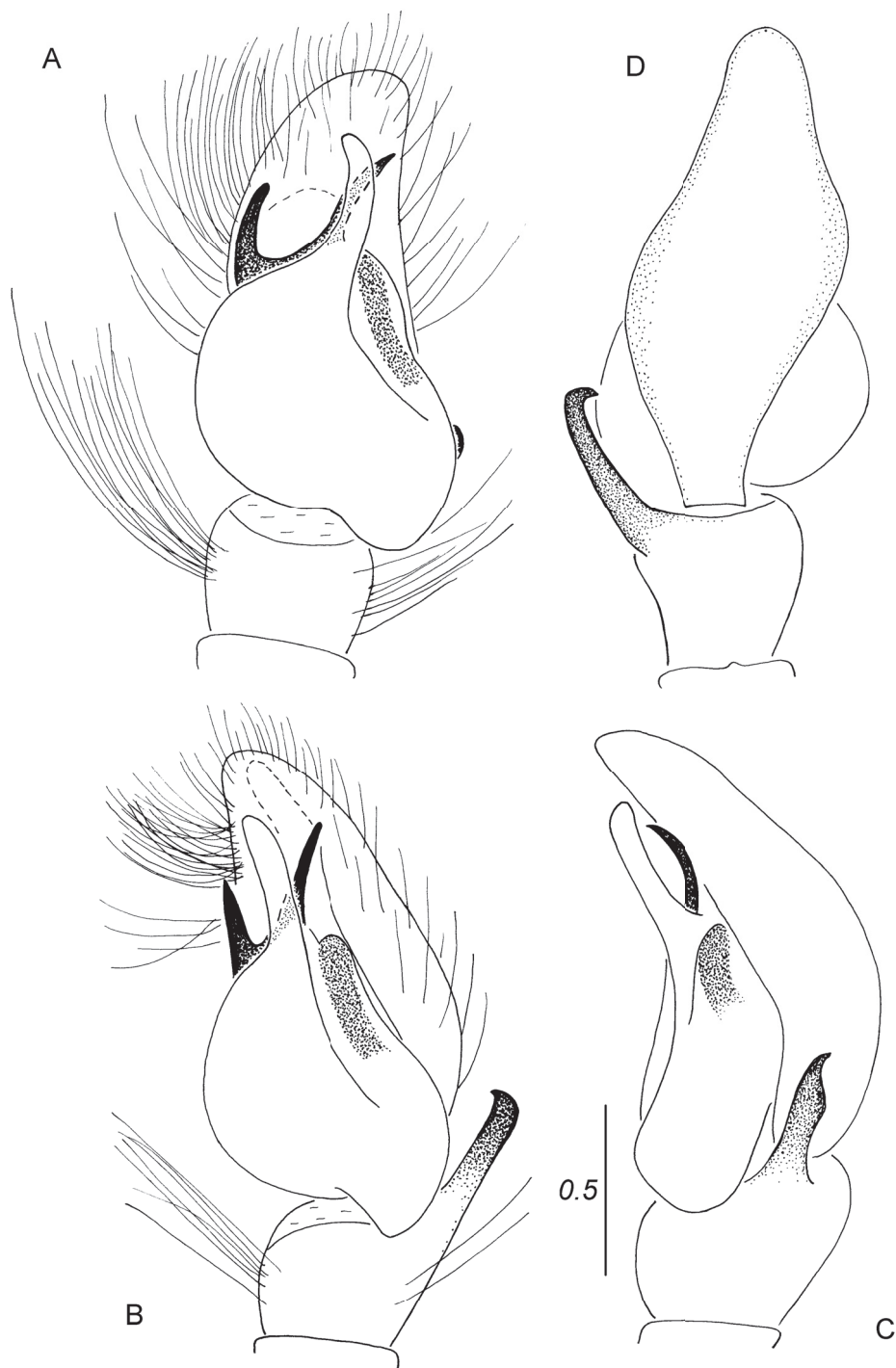
Fig. 2. Thiratoscirtus oberleuthneri sp. nov., holotype, palpal organ. A. Ventral view. B. Ventrolateral view. C. Lateral view. D. Dorsal view. Scale bar for all figures = 0.5 mm.