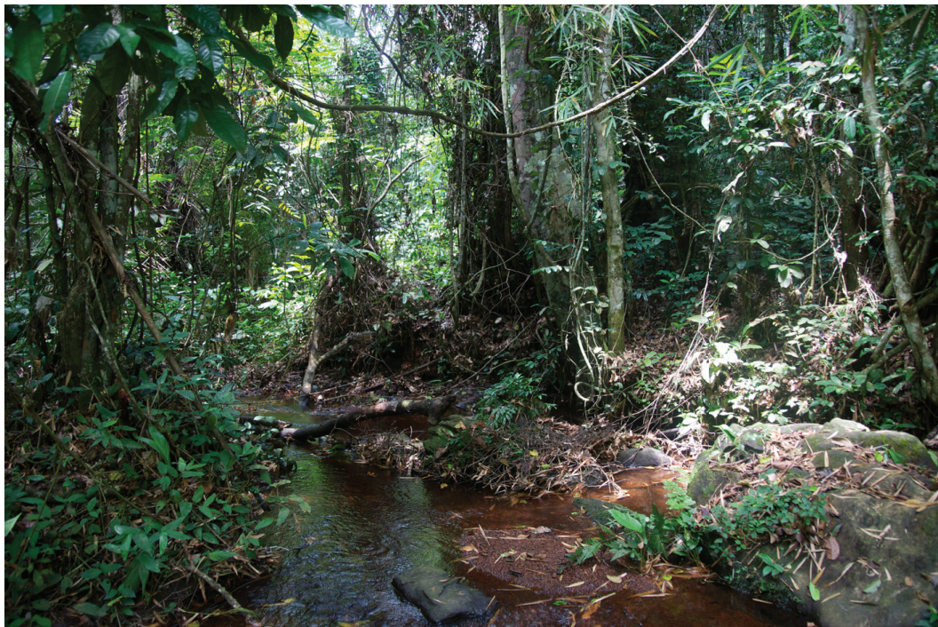
Fig. 3. Natural habitat of Thiratoscirtus oberleuthneri sp. nov. in Midzic, Gabon.