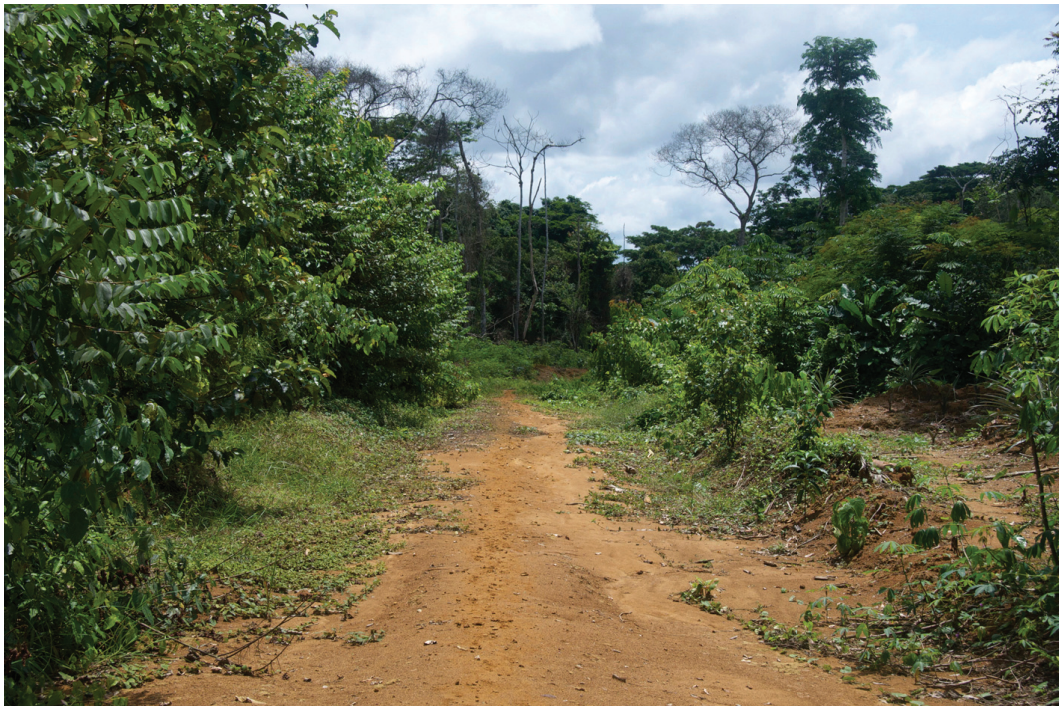
Fig. 6. Natural habitat of Thiratoscirtus lamboji sp. nov., 122 km south of Makokou, Gabon.