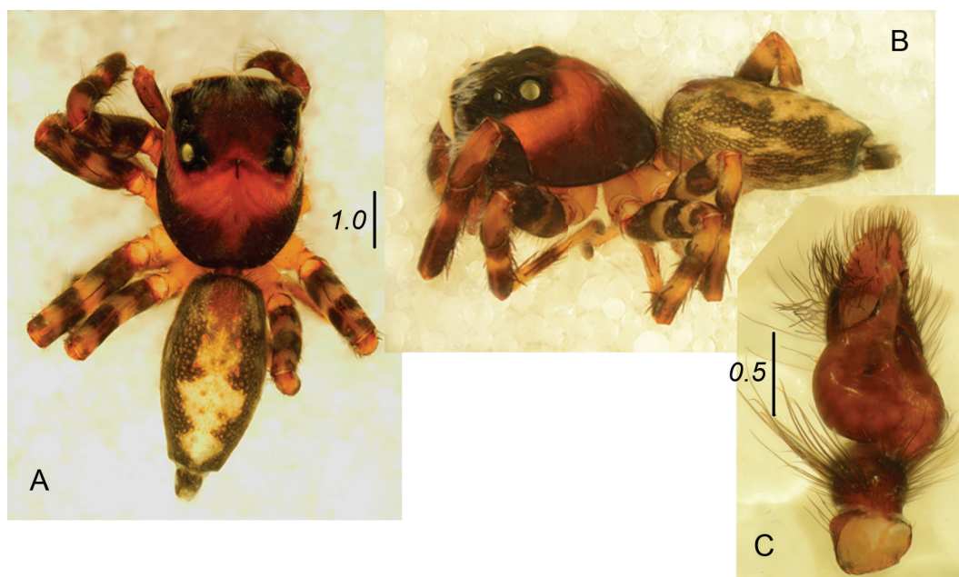
Fig. 1. Thiratoscirtus oberleuthneri sp. nov., holotype, male. A. General appearance, dorsal view. B. General appearance, lateral view. C. Palp, ventral view. Scale bars: A–B = 1 mm, C = 0.5 mm.