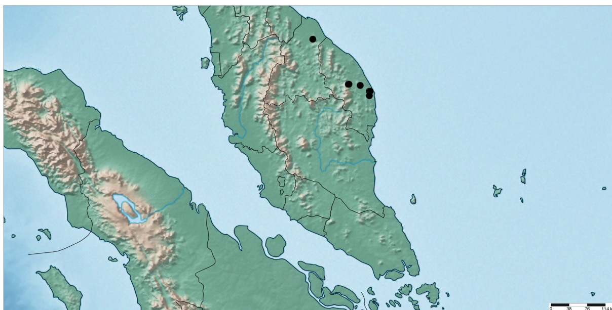
Fig. 2. Map showing the collecting localities of Polyalthia pakdin I.M. Turner & Utteridge sp. nov.

Polyalthia rufa Craib, Bulletin of Miscellaneous Information, Kew 1924: 82 (Craib 1924). – Type: Thailand, Nakawn Sawawn, Mè Wong, 25 May 1922, A.F.G. Kerr 6022 (holo-: K[×2] (K00595497, K00595496); iso-: ABD, BM (000553972(BM))).