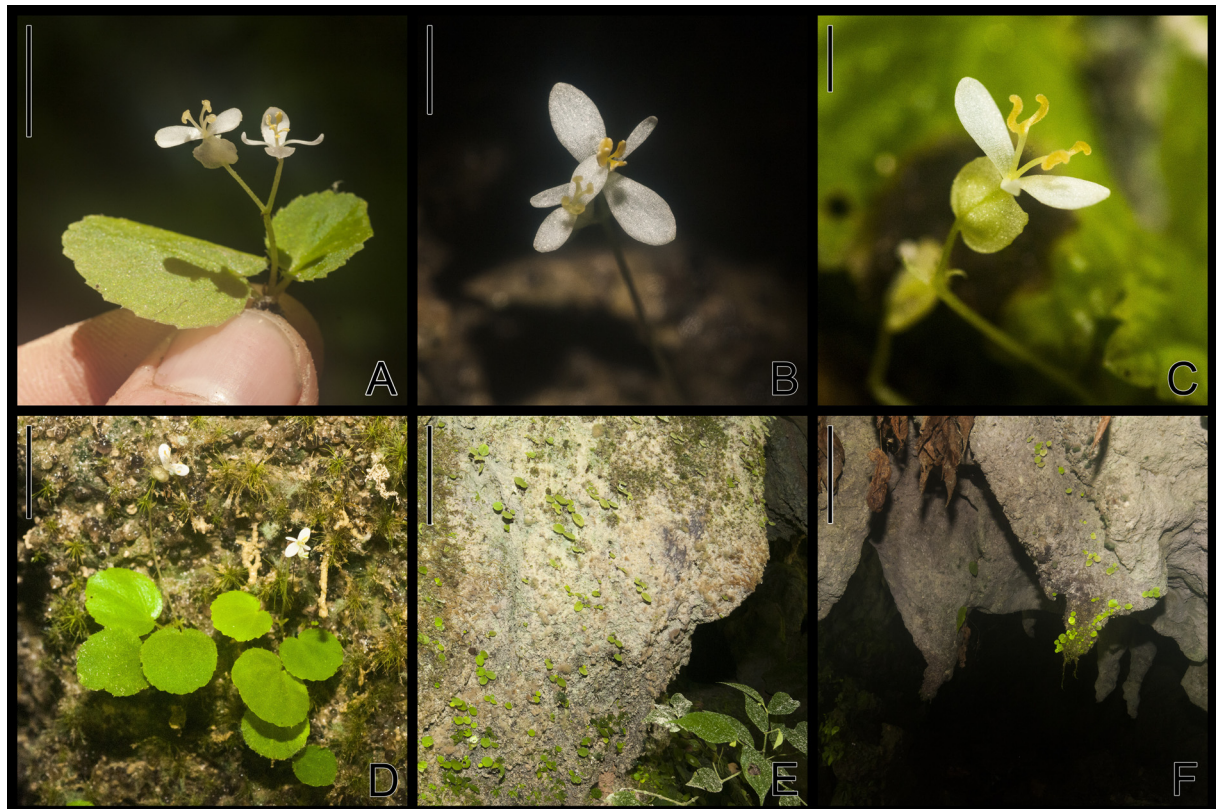
Fig 3. Begonia elachista Moonlight & Tebbitt sp. nov. A. Whole plant. B. Male and female flower, front view. C. Female flower, side view. D. Habit and associated vegetation. E–F. Habitat and wild population. Scale bars: A = 1 cm; B = 5 mm; C = 2 mm; D = 2 cm; E–F = 10 cm. All from P. Moonlight & A. Daza 318 (E).

Caulесcent, tuberous herb. Tuber subglobose, 1–2 mm in diam. Stems 1–3 per tuber, erect, ca 0.2 mm in diam., 5–30 mm long, unbranched, internodes 1.5–7.5 mm long, glabrous, light green. Stipules persistent, narrowly lanceolate, 0.5–1.5 × 0.2–0.5 mm, apex acuminate, aristate, terminal hair ca 0.4 mm long, margin entire, with 1–2 ciliate hairs to 0.2 mm on each side. Leaves 1–4, alternate, basifixed; petiole orientated in same direction as the main vein of blade, 8–25 mm long, glabrous, blade symmetrical to subsymmetric, ovate to suborbicular, 8–30 × 7–25 mm, membranous, apex obtuse, base cordate, basal lobes not overlapping, sinus 0.5–2 mm deep, margin irregularly crenate, ciliate, the hairs to 0.3 mm, upper surface glabrous, light grey-green, lower glabrous, light grey-green, veins palmate, 5–7, secondary veins indistinct. Inflorescences 1–2, axillary, arising from axis of each leaf, erect, an asymmetric dichasial cyme, with 1–2 branches, bearing up to 2 male flowers and up to 2 female flowers, usually protandrous but basal-most female flower often opening concurrently with the apical male flower; peduncle 5–40 mm long, glabrous; pedicels of male flowers 2–6 mm long, glabrous; pedicels of female flowers 1–5 mm long, glabrous; bracts persistent, elliptic, 1.5–2.5 × 0.1–0.3 mm, apex acuminate, margin entire, glabrous or with up to 2 ciliate hairs to 0.2 mm on each side, dark brown.