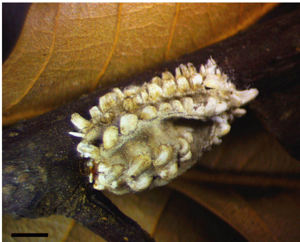
Fig. 1. Gompholopium quercicola gen et sp. nov., paratype, dry ♀ (ZIN RAS, K 1548) on twig of host plant. Scale bar = 1 mm.