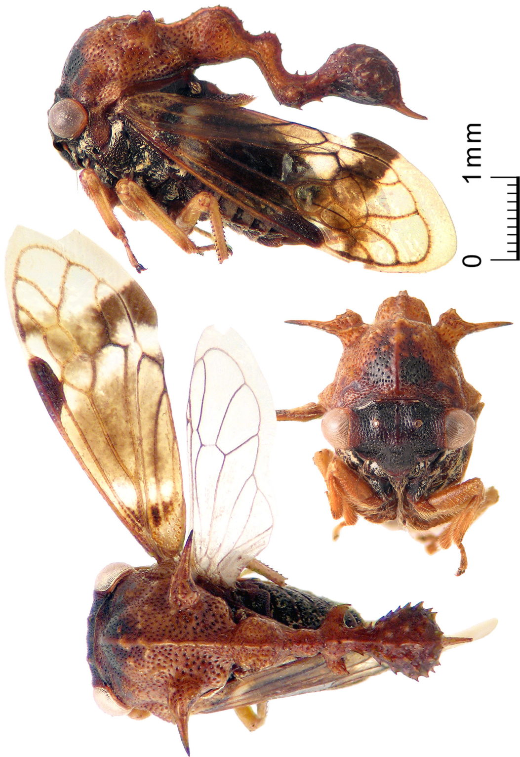
Fig. 2. Hamma spinellii sp. nov., holotype, ♀, Gabon, Ogoûé Ivindo, Mont Sassamongou, Batouala, 30 Nov. 2012, A. Susini leg. (MSNS).