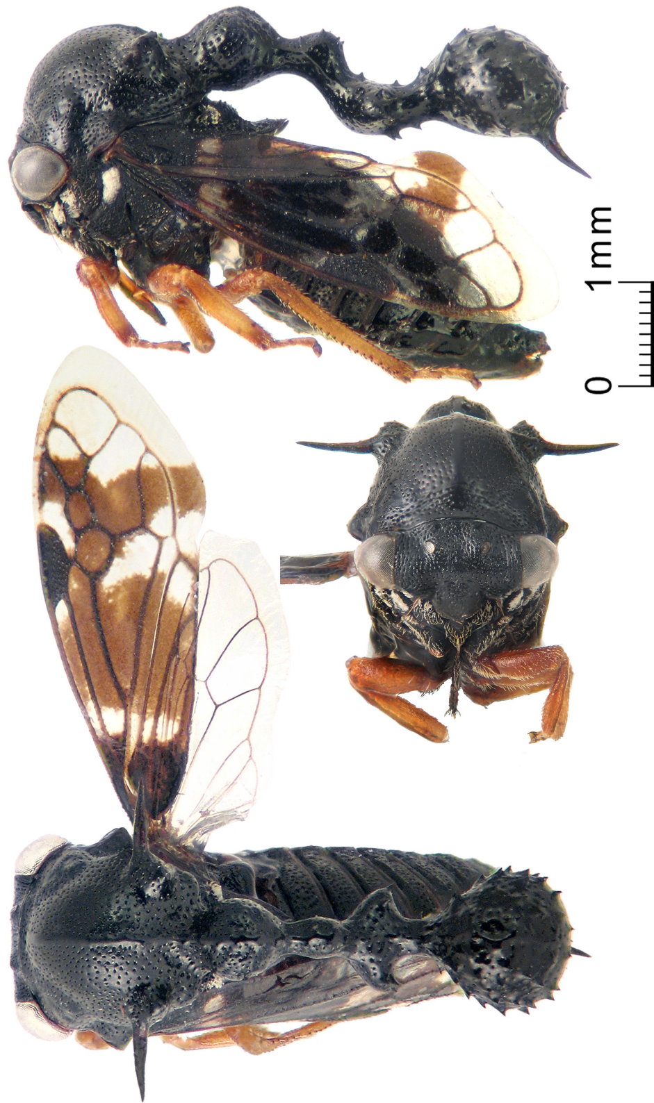
Fig. 1. Hamma nigrum sp. nov., holotype, ♀, Gabon, Ogouè Ivindo, Batuala, 1 Dec. 2012, A. Susini leg. (MSNS).