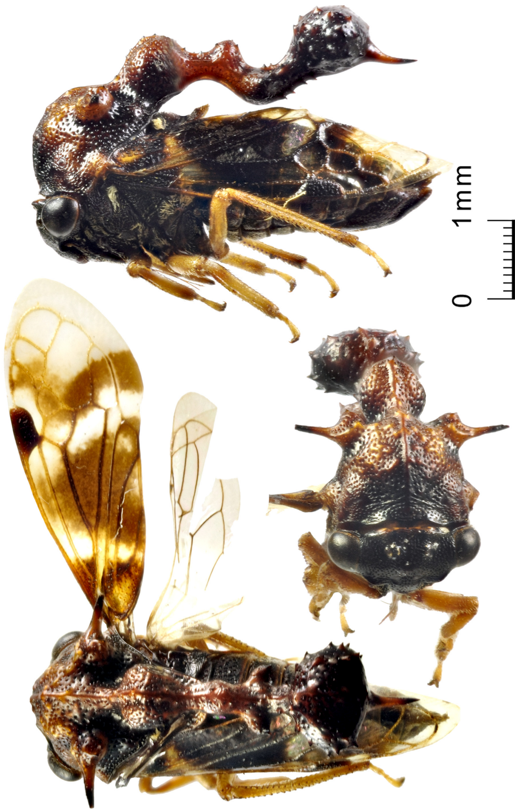
Fig. 3. Hamma caneparii sp. nov., holotype, ♀, Gabon, Ogooué Lolo, Inzambò (Iboundji), m 427, 0.1°6'21.7" S, 0.11°51'17.8" E, 24 Nov. 2012, A. Susini leg. (MSNS).