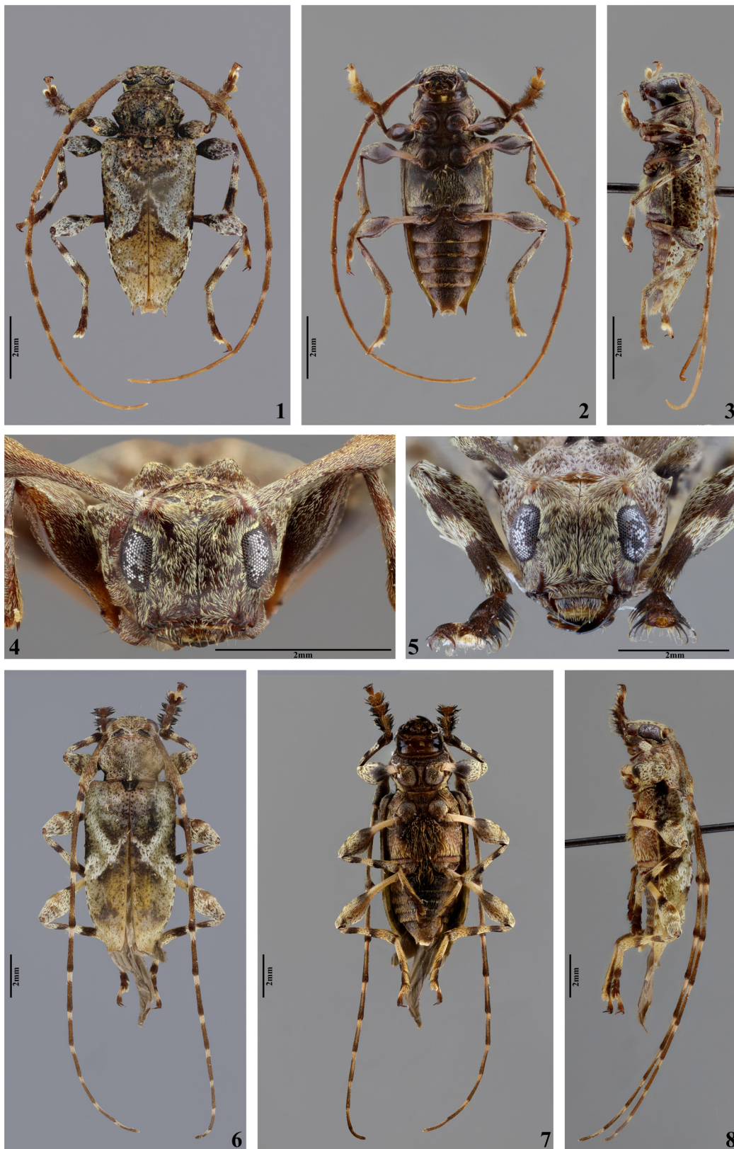
Figs 1–8. 1–4. Alcathousiella giesberti sp. nov. Holotype, ♂ (FSCA). 1. Dorsal habitus. 2. Ventral habitus. 3. Lateral habitus. 4. Head, frontal view. 5–8. Alcathousiella polyrhaphoides White, 1855. Males from Bolivia (FSCA). 5. Head, frontal view. 6. Dorsal habitus. 7. Ventral habitus. 8. Lateral habitus.