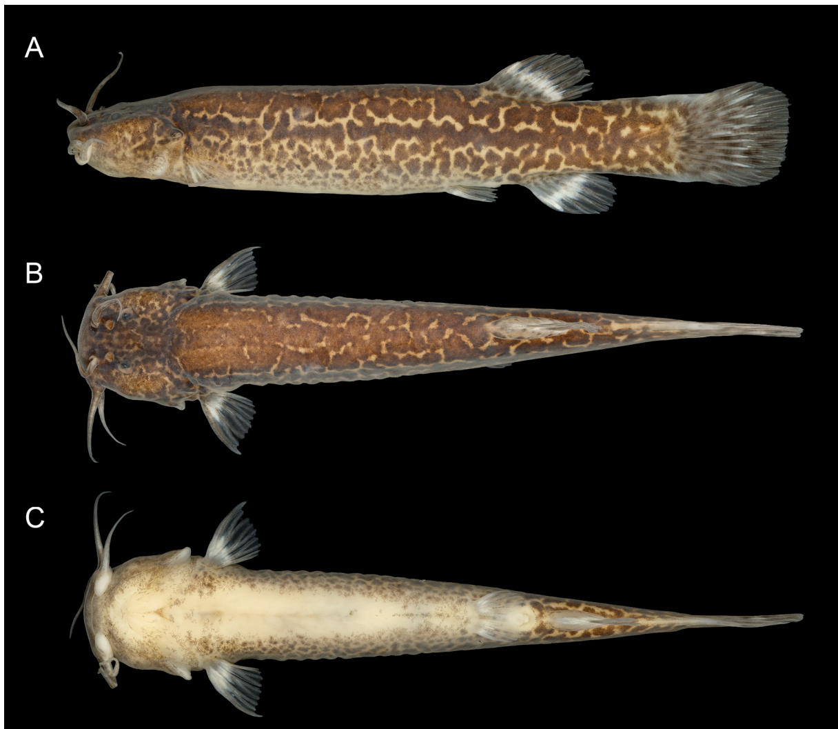
Fig. 1. Cambeva alphabelardense sp. nov., holotype (UFRJ 6990), 43.4 mm SL. A. Left lateral view. B. Dorsal view. C. Ventral view.

GENERAL MORPHOLOGY. Morphometric data appear in Table 1. Body relatively slender, subcylindrical and slightly depressed anteriorly, compressed posteriorly. Greatest body depth in area just anterior to pelvic-fin base. Dorsal and ventral profile of head and trunk slightly convex, approximately straight on caudal peduncle. Skin papillae minute. Anus and urogenital papilla in vertical through anterior portion of dorsal-fin base. Head sub-rectangular in dorsal view, almost rectangular. Anterior profile of snout slightly convex in dorsal view. Eye small, dorsally positioned in head, in its anterior half. Posterior nostril located approximately mid-way between anterior nostril and orbital rim. Tip of maxillary and rictal barbels posteriorly reaching interopercular patch of odontodes; tip of nasal barbel usually posteriorly reaching area just anterior to opercular patch of odontodes, sometimes shorter, reaching midway between orbit and opercular patch of odontodes. Mouth subterminal. Jaw teeth 20–23 on premaxilla, 24 or 25 on dentary, pointed and slightly curved, arranged in two irregular rows. Branchial