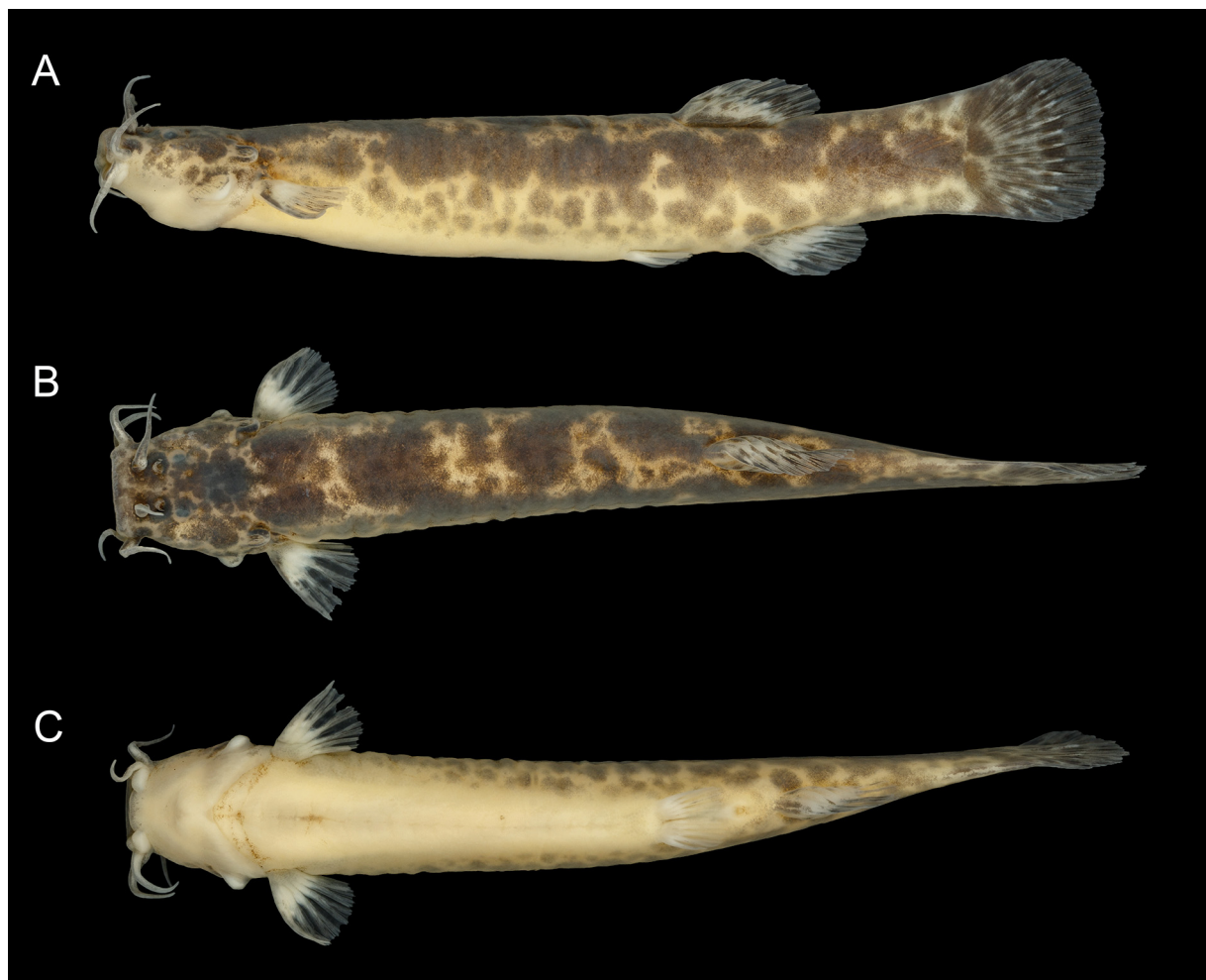
Fig. 5. Cambeva betabelardense sp. nov., holotype (UFRJ 6995), 42.7 mm SL. A. Left lateral view. B. Dorsal view. C. Ventral view.