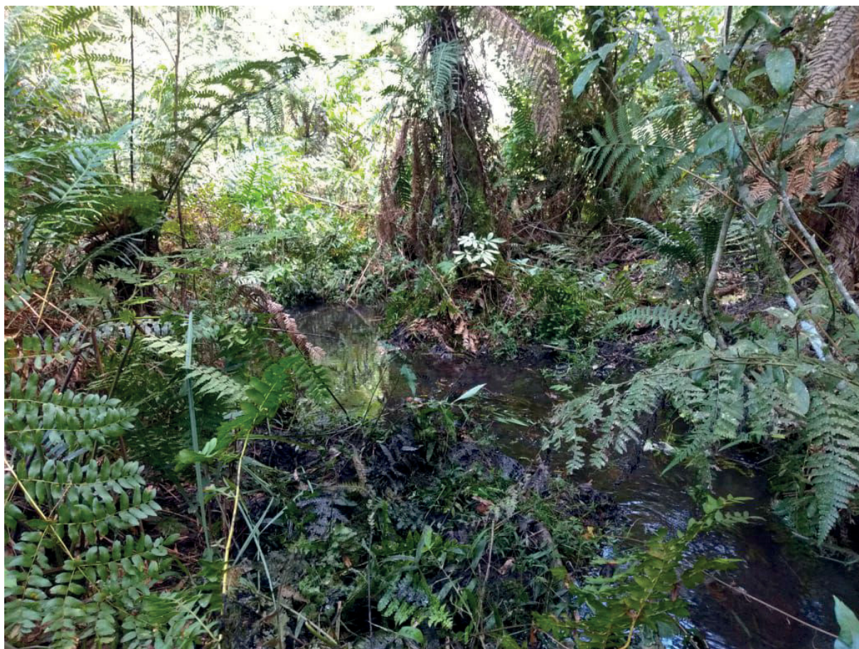
Fig. 4. Type locality of Cambeva alphabelardense sp. nov.

Cambeva alphabelardense sp. nov. is known only from the type locality area in the middle Rio Chapecó drainage, Rio Uruguai basin, southern Brazil (Fig. 3). The type locality is situated in the headwaters of a narrow stream, altitude about 800 m a.s.l., with clearwater, clay bottom and dense marginal vegetation mainly composed of ferns (Fig. 4). This short area, about 600 m long, corresponds to a small residual fragment of the original vegetation consisting of a mixed rainforest. This area is now surrounded by a