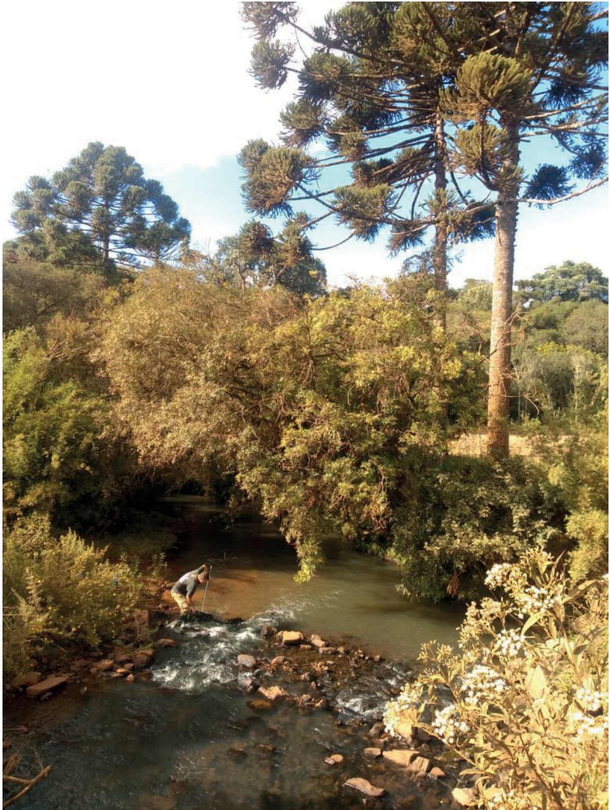
Fig. 6. Type locality of Cambeva betabelardense sp. nov.