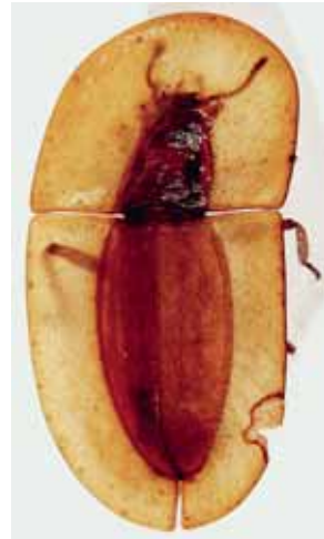
Phot. 3-4: Endustomus sudanensis WASM.