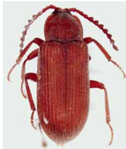
Phot. 8: Gonocnemis termitophilus WSM.