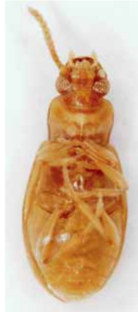
Phot. 1-2: Mimocellus trechoides WASM.