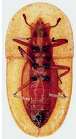
Phot. 5: Endustomus sudanensis WASM.