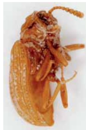
Phot. 6-7: Paragonocnemis (Microgonocnemis) traegaordhi WASM.