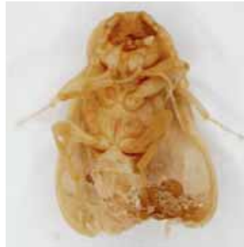
Phot. 9-10: Gonocnemis jaegerskiöldi WASM.