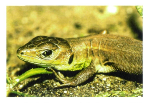
Fig. 1: Lacerta pamphylica SCHMIDTLER, 1975 from the archaeological site of Olympos (province of Antalya, Turkey). The lack of clear pale lines on the body is a distinctive character of young Lacerta pamphylica.

Two of us (MG and JV) found five juveniles of L. pamphylica (fig. 1) on December 16, 1997, at the archaeological site of Olympos, ca. 85 km SSW of Antalya along the coastal road to Finike (province of Antalya) [36,392°N / 30,486°E]. These lizards were