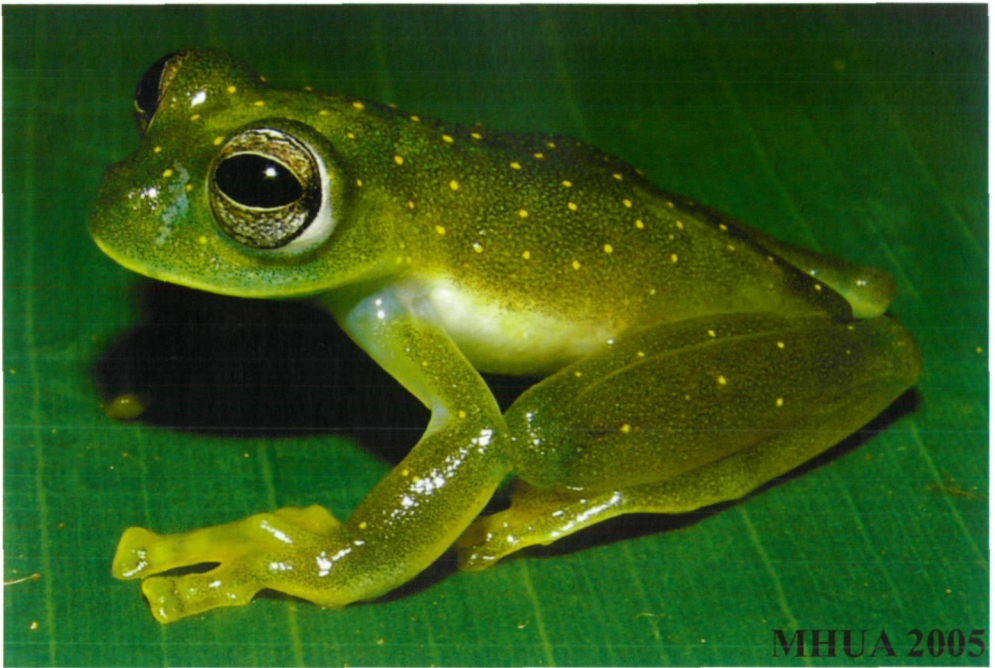
Figure 1: Female Cochranella punctulata RUIZ-CARRANZA & LYNCH, 1995 (MHUA 4071) from Vereda Las Brisas, municipio Maceo, department of Antioquia, Colombia.