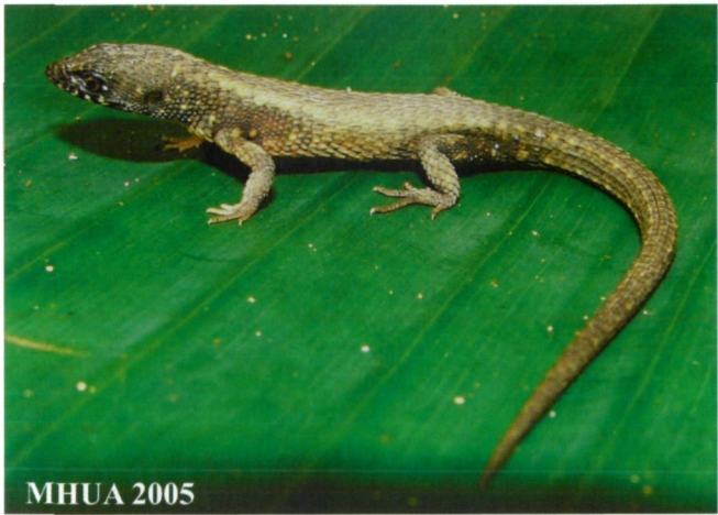
Fig. 1. Leposoma southi RUTHVEN & GAIGE, 1924 (MHUA 11399) from Vereda Las Brisas, municipio Maceo, department of Antioquia, Colombia.

(MHUA), Medellín, Colombia (MHUA 11389, 11391). These lizards represent the first documented records of L. southi from the Department of Antioquia and the Cordillera Central of Colombia and extend the known geographic distribution from Bahía Solano municipality, Department of