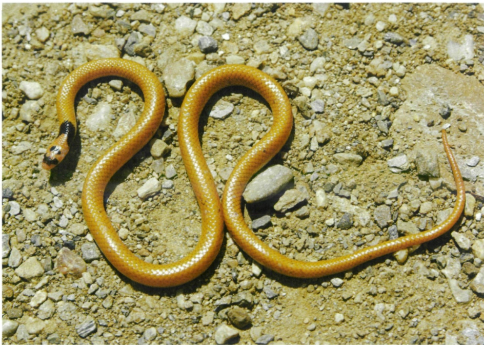
Fig. 2: Rhynchocalamus melanocephalus satunini (NIKOLSKY, 1899). ZDEU 125/2006 from Nurdağı, Gaziantep, Turkey (dorsal view).