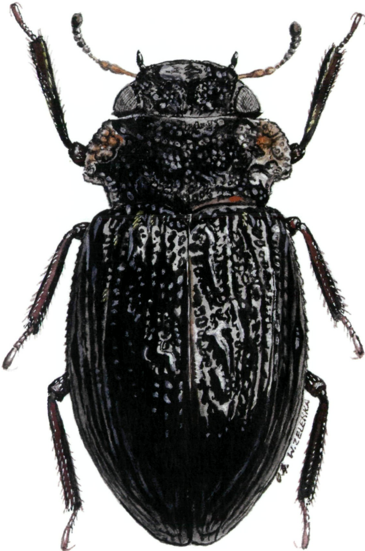
Fig. 1: Ginkgoscia relictata , habitus.