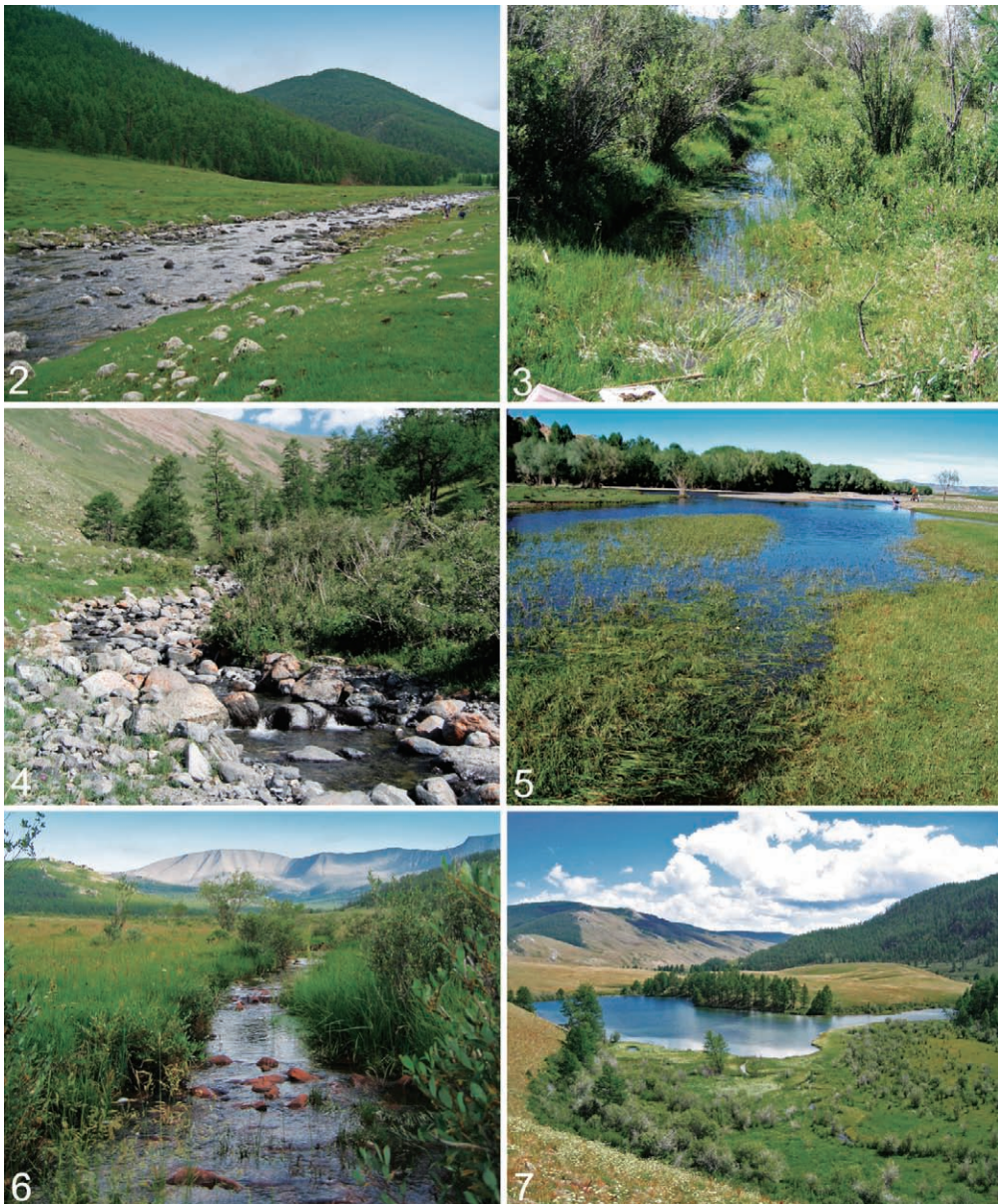
Figs. 2–7: Sampling localities: 2) 35; 3) 42; 4) 45; 5) 47; 6) 55; 7) 63.