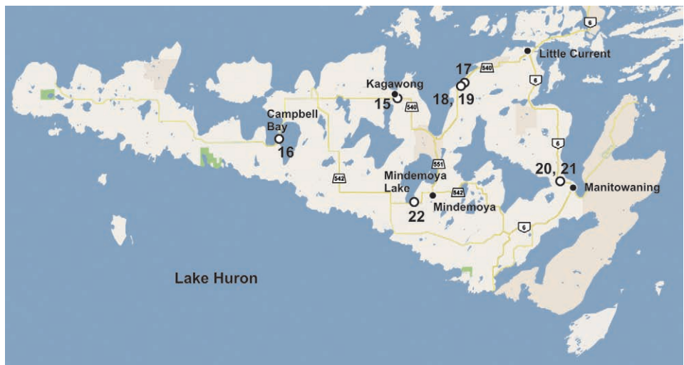
Fig. 2: Map of Manitoulin Island showing sampling sites.