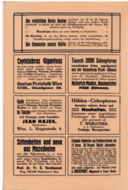
Figs. 1–4: Fascicle covers of early CR volumes, Hoffmann era (1912–1915): 1) front cover of oldest fascicle of CR known to exist today (vol. 1 (1), 1912, archive of ÖZBG); 2) oldest fascicle front cover of CR (vol. 3 (4), 1914) in the WCV archive; 3) peculiar advertisement, fascicle back cover (vol. 3 (12), 1914); 4) fascicle front cover, inside (vol. 4 (8–10), 1915).