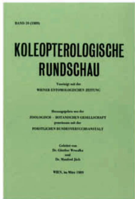
Figs. 9-12: Various CR fascicle front covers (9-10) and volume front covers (11-12) (1945-1989): 9) fasc. 1-3, vol. 31, 1945; 10) fasc. 4-6, vol. 32, 1954; 11), vol. 48, 1970; 12) vol. 59, 1989.