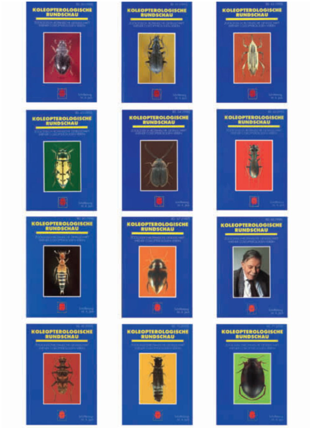
Fig. 13: CR front covers (vols. 60–71, 1990–2001).