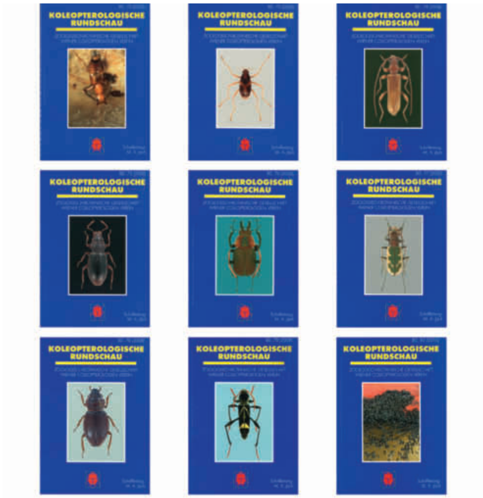
Fig. 14: CR front covers (vols. 72–80, 2002–2010).

Since 2008 all volumes of CR (1911 until today) are available in PDF format in the internet ( http://www.landesmuseum.at/datenbanken/digilit/?serien=1749 ). Volumes 1–59 are free of charge. The remaining volumes are fee-based and can be downloaded from the same URL (web address).