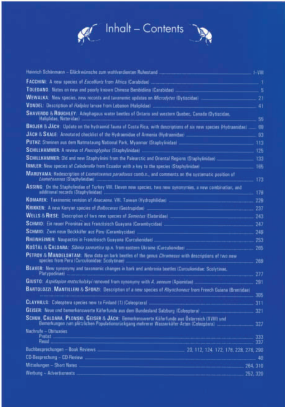
Fig. 16: CR volume back cover (vol. 81, 2011).