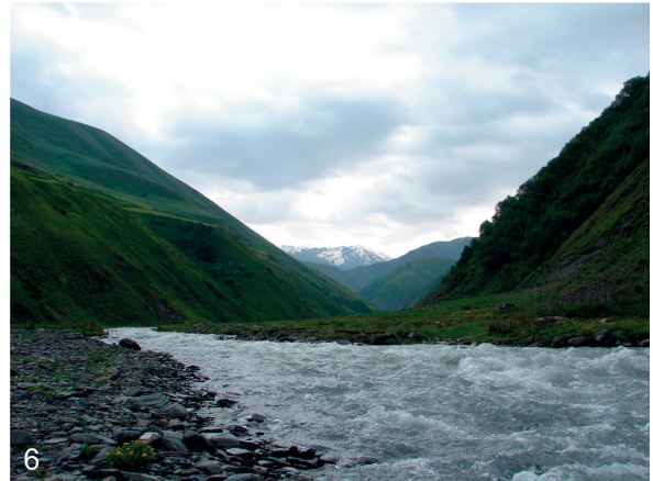
Figs. 1–6: Collecting localities, 1) Loc. 2: N Kochubey, fresh water reservoir near artesian well; 2) Loc. 8: near Biological station “Terskaya”, flooded area of Alikazgan River; 3) Loc. 25: suburb of Makhachkala, eastern slope of Mt. Tarki-Tau; 4) Loc. 28: southern slope of Chonkatau Range, near Gubden; 5) Loc. 32: gorge of Andiyskoe Koysu River, near Chirkata; 6) Loc. 45: Vodorazdel’nyy Range, upper reaches of Dzhurmut River.