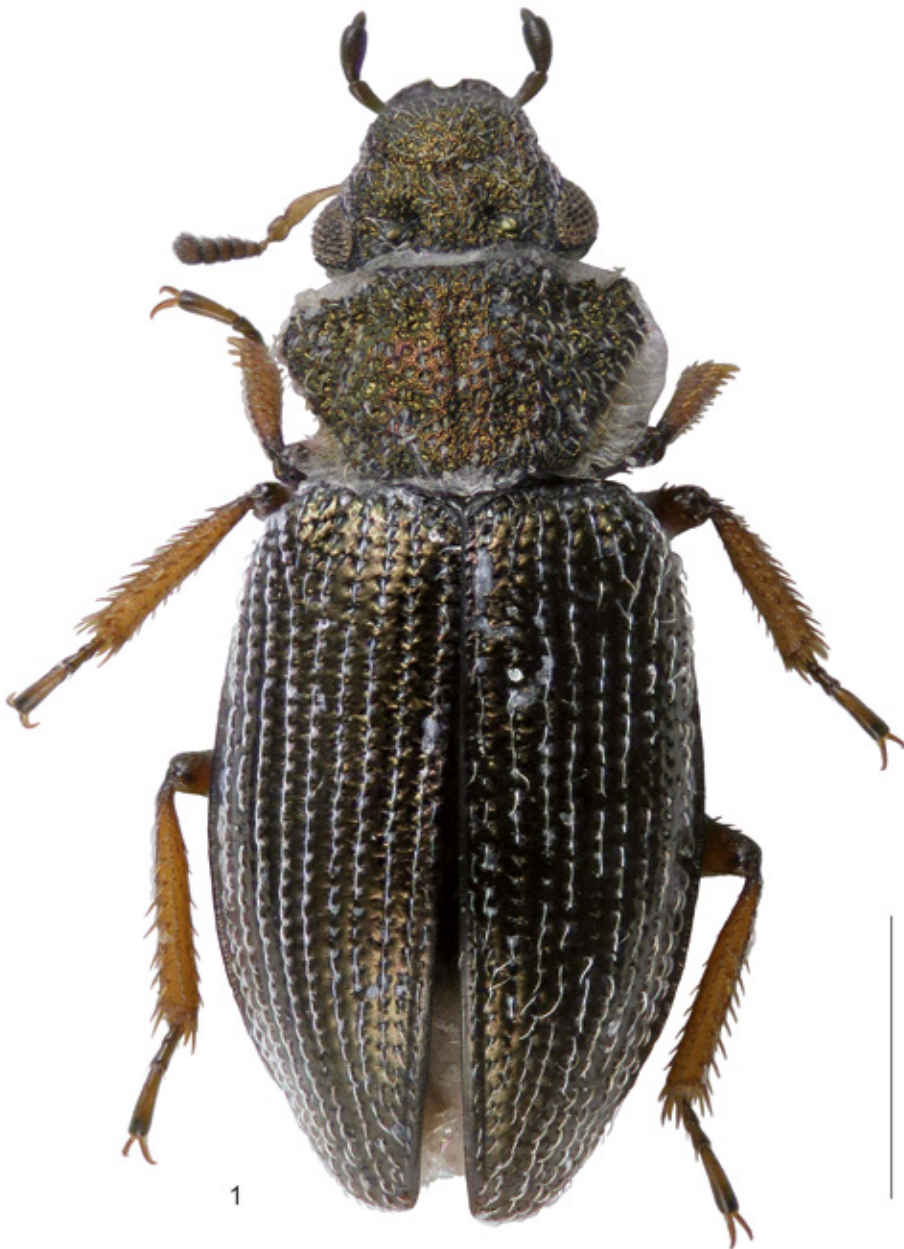
Fig. 1: Habitus of Ochthebius scopuli , holotype. Scale bar: 0.5 mm.