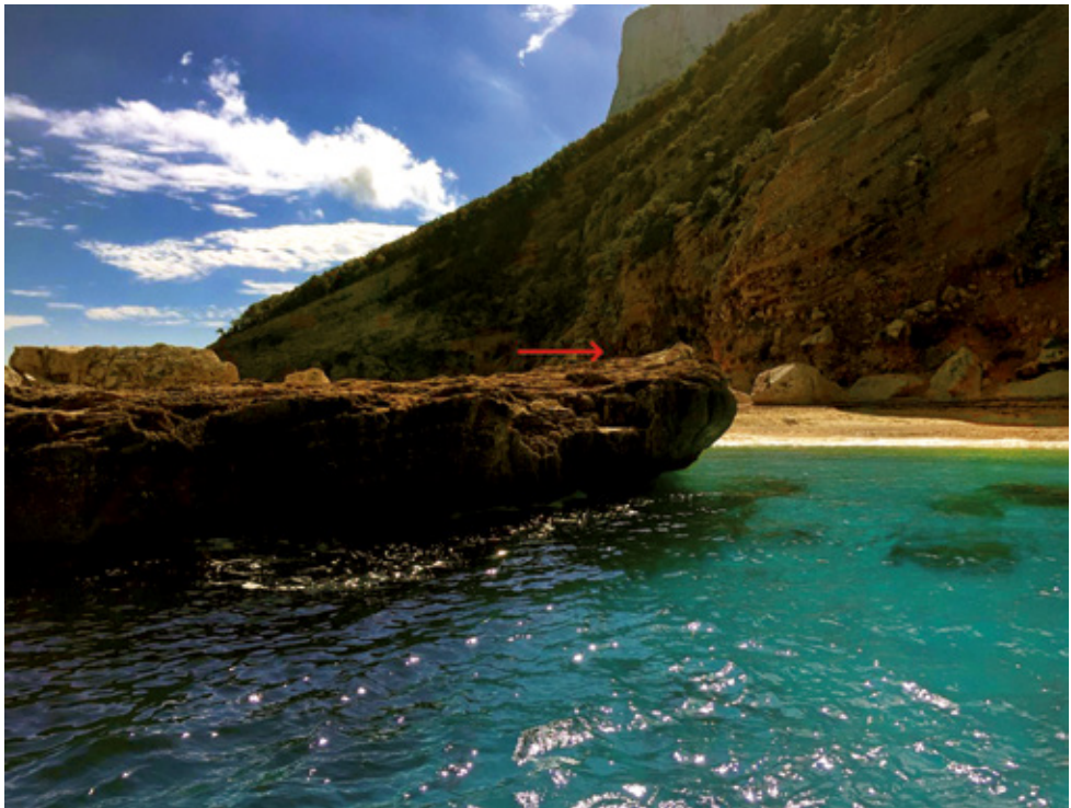
Fig. 3: Type locality of Ochthebius scopuli (Gulf of Orosei, Sardinia). The red arrow points to the exact collecting site, a wet crag at the beach “Cala Mariolu”.

Aedeagus (Fig. 2): Main piece ca. 320 µm long. Distal lobe basally wide, apical half slender and strongly recurved. Hiatus narrow, long and U-shaped, apex slightly widened. Parameres inserted near basal 0.33.