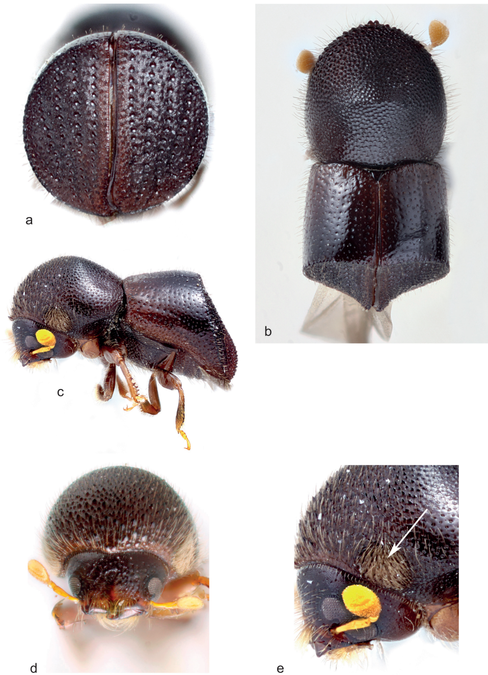
Fig. 1: Cnestus schoenmanni , female: a) caudal view, b) dorsal view, c) lateral view, d) frontal view, e) mycangium on antero-lateral area of pronotum.