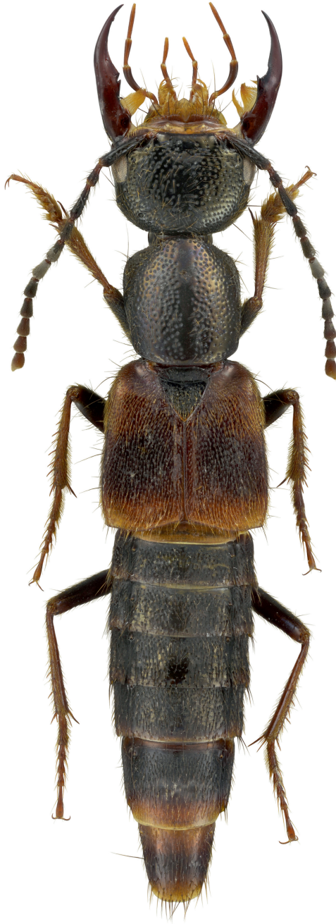
Fig. 1: Shaverdolena maculipennis , holotype, habitus.