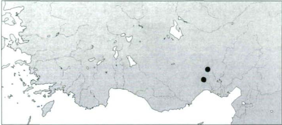
Map 1: Known distribution of Dinusa taurica sp. n. in southern Anatolia.