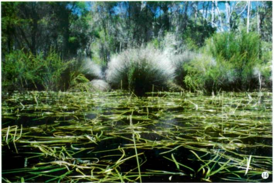
Figs. 13-14: 13 – Loc. 10b, peatland swamp, 20 km south of Northcliffe/ Windy Harbour Road; 14 – Loc. 37, pond, 5 km south of Northcliffe/ Windy Harbour Road.