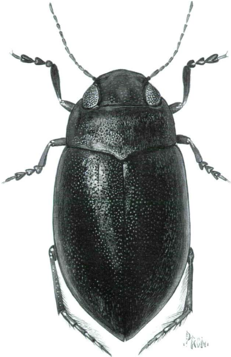
Abb. 2: Habitus and coloration of Antiporus gottwaldi sp.n. (female, 3.2 mm).