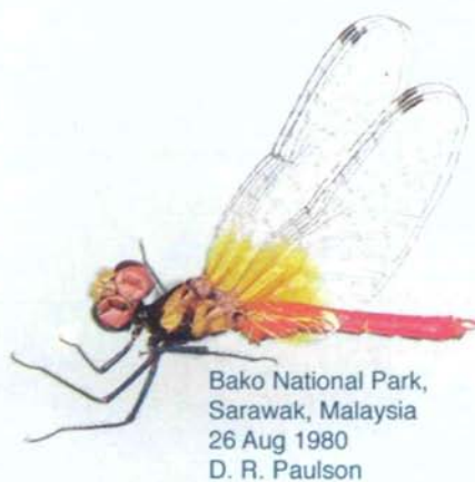
(left) Nannophya paulsoni sp. n., male, lateral; (right) Nannophya pygmaea RAMBUR, male, lateral.