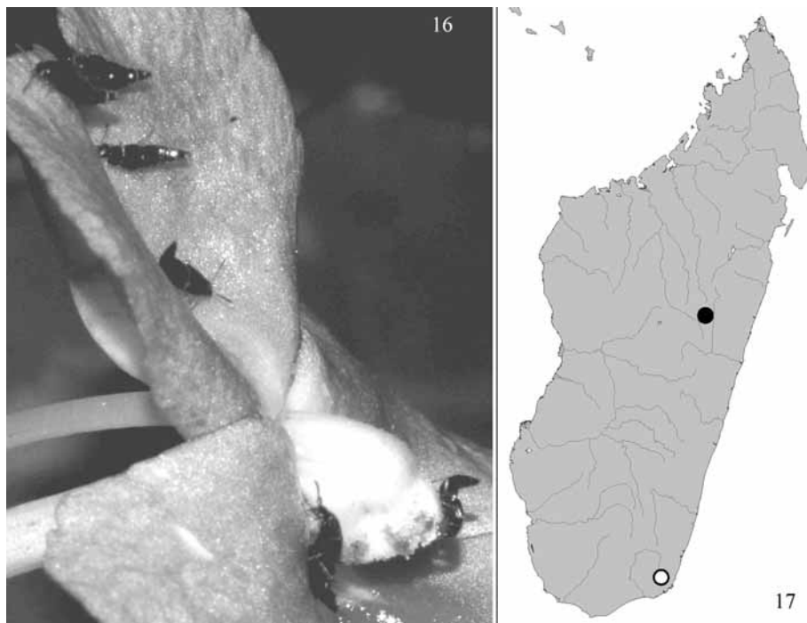
Figs 16-17: (16) Oxypodinus levasseuri in inflorescence of Impatiens vilersii; (17) records of O. floricola (filled circle) and O. levasseuri (open circle) in Madagascar.

Distribution and bionomics: The type locality is situated near Mandraka, eastern central Madagascar (Fig. 17) at an altitude of 1250 m. The specimens were collected from inflorescences of Impatiens lyallii BAKER in a secondary rain forest near a road margin. The beetles were observed in the inflorescences as early as the day after they had opened. Apparently, the beetles were feeding pollen from the stamina. Several specimens were observed in copula (ERPENBACH pers. comm.).