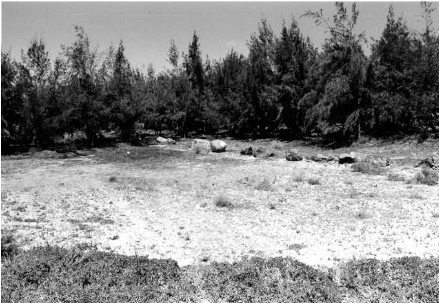
Fig. 1. Nesting site of Cerceris chlorotica near Costa Calma on Fuerteventura.

From the genus Cerceris one endemic species was known: Cerceris concinna . This species occurs on all the islands of the archipelago. On 9 May 2002 a second species of this genus was collected: Cerceris chlorotica SPINOLA 1839. This digger wasp is new for the fauna of the Canary Islands. The species occurs in Northern Africa (SCHMIDT 2000). Three females were captured on the island of Fuerteventura and further specimens have been observed. They were collected at their nesting site, north of the village Costa Calma. A number of nests were located, on an almost bare, triangle-shaped, sandy area, which was screened at the south- and westside by shrubs and young trees (Fig. 1).