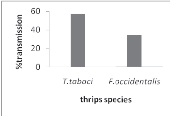
Fig. 1: Rate of transmission of TYRV-CI to petunia plants by T. tabaci and F. occidentalis .