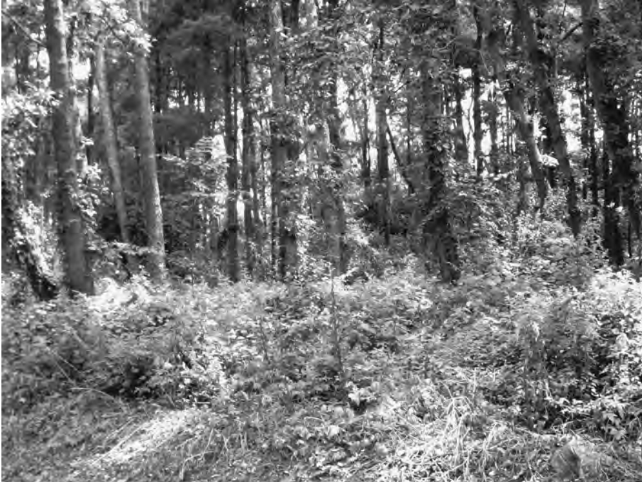
Fig. 8: Type locality of Pronomaea maxima nov.sp.

Distribution and bionomics: The type locality (Fig. 8) is situated in a mountain to the west of Gejiu, southern Yunnan. The specimens were sifted from moist leaf litter in a mixed forest with dense undergrowth at an altitude of nearly 2000 m. Remarkably, all the specimens were in only one of a total of about 25 samples of sifted material, suggesting that they are confined to a special habitat.