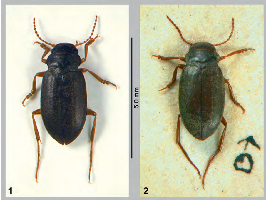
Figs 1-2: Habitus of (1) Deronectes tashk nov.sp. (holotype, male) and (2) Deronectes longipes SHARP, 1882 (lectotype, male; on original glue card with SHARP's gender symbol).

brownish; entire surface reticulate, meshes slightly less impressed than on head; near sides meshes even less distinct. Punctuation double, but coarser punctures on disc very sparse, much denser near anterior and posterior margins and near sides; no distinct punctures line present behind anterior and before posterior margins. Centre of disc with one rather deep longitudinal puncture. Light yellowish setae present on entire surface, but very sparse on disc.