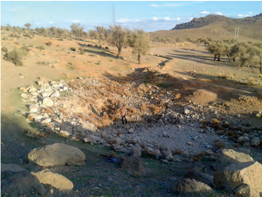
Fig. 12: Collecting site of Deronectes tashk nov.sp., Emamzadeh spring (pool) and Emamzadeh brooklet (in the background), both totally drained in April 2014; G. HASANSHAHI in the middle of the pool.

E t y m o l o g y: The specific epithet relates to the salty Lake Tashk and two villages (Tashk and Abadeh Tashk) situated near the pool in which all type specimens have been collected. It is a noun in the nominative singular standing in apposition.