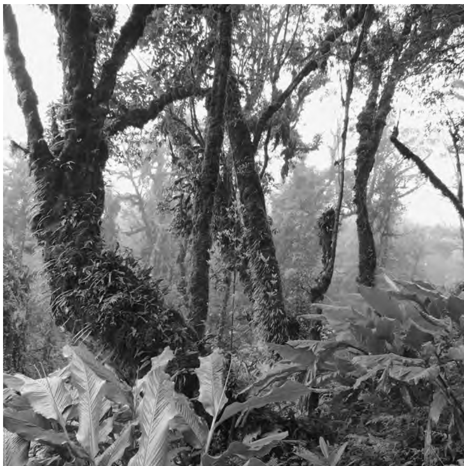
Fig. 14: Type locality of Algon fansipanicus .

♂: sternite VIII (Fig. 9) with broadly V-shaped posterior excision; aedeagus (Figs 10-13) very long and slender, 2.1 mm long; median lobe apically bent and subapically dentate in lateral view, very acute in ventral view; paramere slender, apically not reaching apex of median lobe, much more slender than median lobe in ventral view, and with one peg-seta at some distance from the apex.