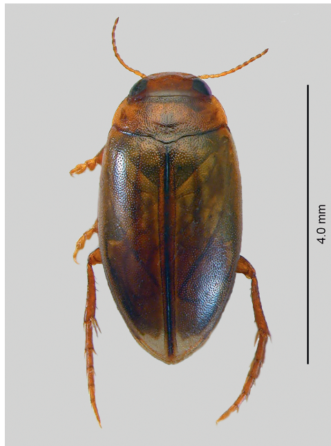
Fig. 2: Habitus of Hygrotus (Coelambus) nubilus (LECONTE, 1855); male specimen from Lake Waiau, Hawaii.