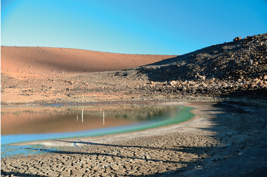
Fig. 1: Lake Waiau, Mauna Kea Volcano on the Island of Hawaii; (photo by T. Tunsch; available under < http://www.panoramio.com/photo/81368979 >) (copyright: © CC BY-SA Thomas Tunsch (th-t.de) / www.panoramio.com/photo/81368979 )