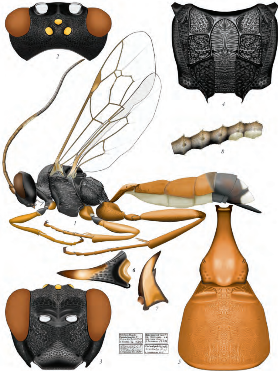
Plate 1: Pseudoplatylabus violentus (GRAVENHORST, 1829), ♀, ♂ (8).