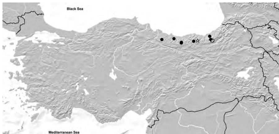
Map 1: Distribution of micropterous Quedius (Raphirus) species with punctate scutellum in Turkey: Quedius reitteri (black circles), Q. omissus (white circle); Q. brevalatus (white triangle); Q. sp. (white star).

Comment: The above female is similar to Q. omissus , but distinguished by a differently shaped tergite IX and slightly longer elytra. Males would be required to clarify its identity.