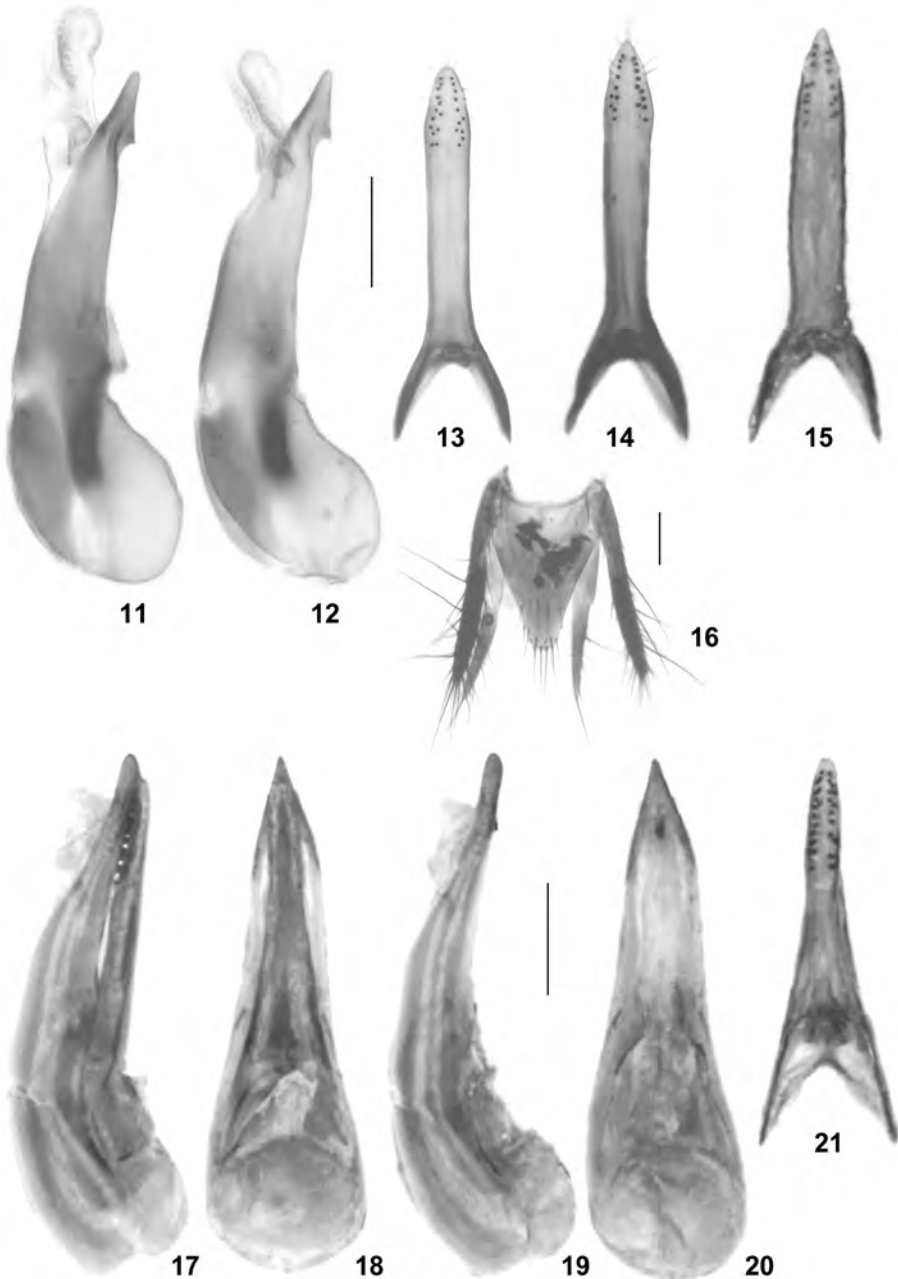
Figs 11-21: Quedius brevalatus from Armenia (11-14) and Turkey (15-16), and Q. omissus from Turkey (17-21): (11-12, 19-20) median lobe of aedeagus in lateral and in ventral view; (13-15, 21) paramere; (16) female abdominal segments IX-X; (17-18) aedeagus in lateral and in ventral view. Scale bars: 0.2 mm.