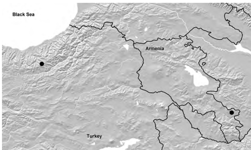
Map 2: Distribution of Quedius brevalatus .