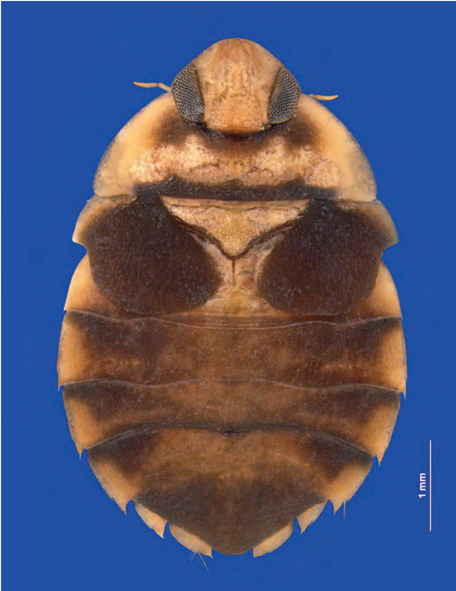
Fig. 1: Aphelocheirus aschalewi nov.sp., habitus of brachypterous male (holotype); legs omitted.

Genitalia of male: Genital capsule posteriorly slightly acuminate (Fig. 4), apex narrowly rounded. Parandria (Fig. 4) strongly developed, left one surpassing right one; left paramere wide, apex rounded and slightly curved mesally; right parandrium distally with a roundish swelling. Aedeagus (Fig. 4) consisting of a narrow, basally slightly widened sclerotised