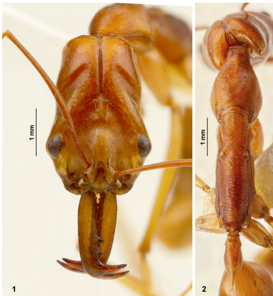
Figs 1–2. Odontomachus pangantihoni nov.sp., paratype: (1) head, frontal view; (2) mesosoma and petiole, dorsal view.

Distribution. Endemic to the Philippines and only known from the island of Panay (Aklan Province).