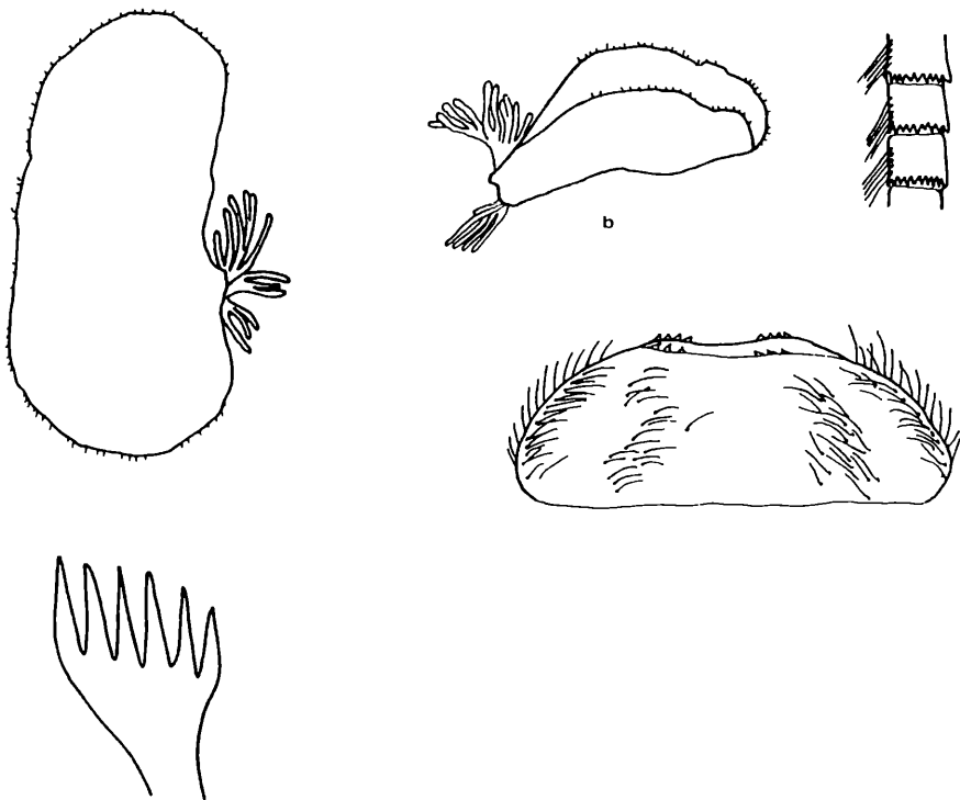
Fig. 3: Rhithrogena savoiensis . a = 1st gill, b = 7th gill, c = fragment of caudal filament, d = labrum, e = 5th comb-shaped bristle from maxillary lacinia