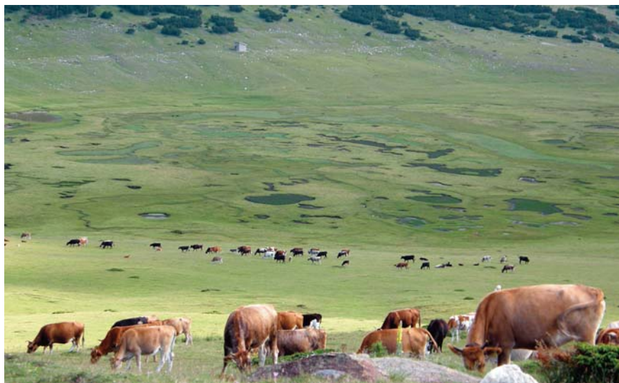
Figure 1: View of the ‘Begovo Pole’ wetland, habitat of Aeshna cyanea and A. juncea on Mt. Jakupica in central Macedonia in July 2008. — Abbildung 1: Blick auf das Feuchtgebiet ‘Begovo Pole’, Lebensraum von Aeshna cyanea und A. juncea im Jakupica-Gebirge in Zentral-Mazedonien im Juli 2008. (Photo: BM).

‘Begovo Pole’ is a high mountain karst plateau situated among several peaks higher than 2000 m, including the summit of Mt. Jakupica (Solunska Glava, 2538 m a.s.l.). Its size is about 4 km 2 , the ground is covered by morainic material and partially by silt clay and clay sands. Two small streams are slowly meandering on the plateau and are joined in a sinkhole on the south of the plateau. During our visit, the occurrence of numerous small pools gave a special appearance to this locality (Fig. 1). Some of the pools were without any water vegetation, and some were overgrown with Equisetum sp. The prevailing plant community was Caricetum macedonicae , without any Sphagnum . The surroundings of the wetland were covered by the community Deltoideo-Nardetum .