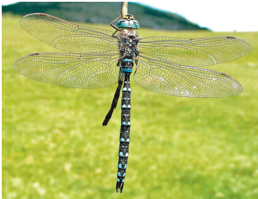
Figure 3: A male Aeshna juncea at 'Begovo Pole', 13-vii-2008. — Abbildung 3: Ein Männchen von Aeshna juncea bei 'Begovo Pole', 13.07.2008.