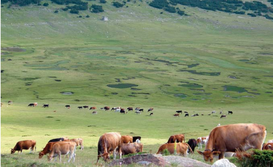
Figure 1: View of the ‘Begovo Pole’ wetland, habitat of Aeshna cyanea and A. juncea on Mt. Jakupica in central Macedonia in July 2008. — Abbildung 1: Blick auf das Feuchtgebiet ‘Begovo Pole’, Lebensraum von Aeshna cyanea und A. juncea im Jakupica-Gebirge in Zentral-Mazedonien im Juli 2008.

‘Begovo Pole’ is a high mountain karst plateau situated among several peaks higher than 2000 m, including the summit of Mt. Jakupica (Solunska Glava, 2538 m a.s.l.). Its size is about 4 km 2 , the ground is covered by morainic material and partially by see clay and clay sands. Two small streams are slowly meandering on the plateau and are joined in a sinkhole on the south of the plateau. During our visit, the occurrence of numerous small pools gave a special appearance to this locality (Fig. 1). Some of the pools were without any water vegetation, and some were overgrown with Equisetum sp. The prevailing plant community was Caricetum macedonicae , without any Sphagnum . The surroundings of the wetland were covered by the community Deltoideo-Nardetum .