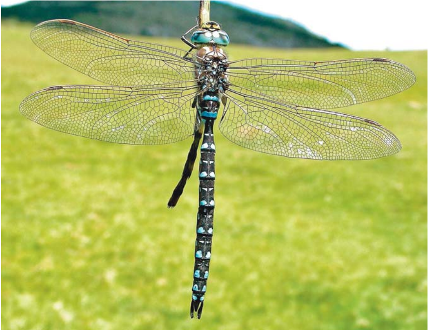
Figure 3: A male Aeshna juncea at 'Begovo Pole', 13-vii-2008. — Abbildung 3: Ein Männchen von Aeshna juncea bei 'Begovo Pole', 13.07.2008.