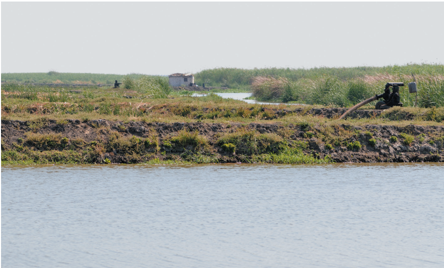
Figure 3: Fish farms south of Lake Idku (Buhairat Idkū), Egypt, showing the destruction of potentially favourable areas for Agriocnemis sania (10-v-2009). – Abbildung 3: Fischzuchten südlich des Idku-Sees (Buhairat Idkū), Ägypten, ein Beispiel für die Zerstörung potentieller Habitate von Agriocnemis sania (10.05.2009).