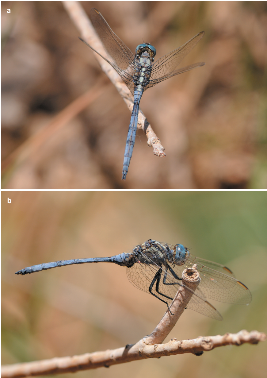
Figure 5a and 5b: Orthetrum machadoi, male, Siwa Oasis, Egypt (12-v-2009). – Abbildung 5a und 5b: Orthetrum machadoi, Männchen, Oase Siwa, Ägypten (12.05.2009).