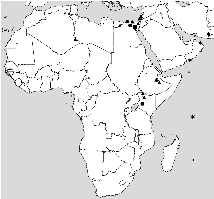
Figure 4: Distribution of Agriocnemis sania . – Abbildung 4: Verbreitung von Agriocnemis sania . ▲ data < 1980, partly extinct (Libya and Near East), Nachweise vor 1980, Vorkommen z.T. erloschen (Libyen und Naher Osten); ■ records from 1990 (Sinai) and 2005 (Kenya), Nachweise von 1990 (Sinai) und 2005 (Kenia); ● new data 2009, neue Nachweise 2009; ★ nearest records assigned to Agriocnemis pygmaea , nächste Nachweise, die Agriocnemis pygmaea zugerechnet werden.

Like I. evansi , I. fountaineae is salt-tolerant, but in Siwa it is much less common and is dominant only at the most saline waters. Females are always heterochromatic – orange, brown or dirty green, depending on age, and black – and lack a black humeral stripe. Like the previous species, I. fountaineae was recorded for