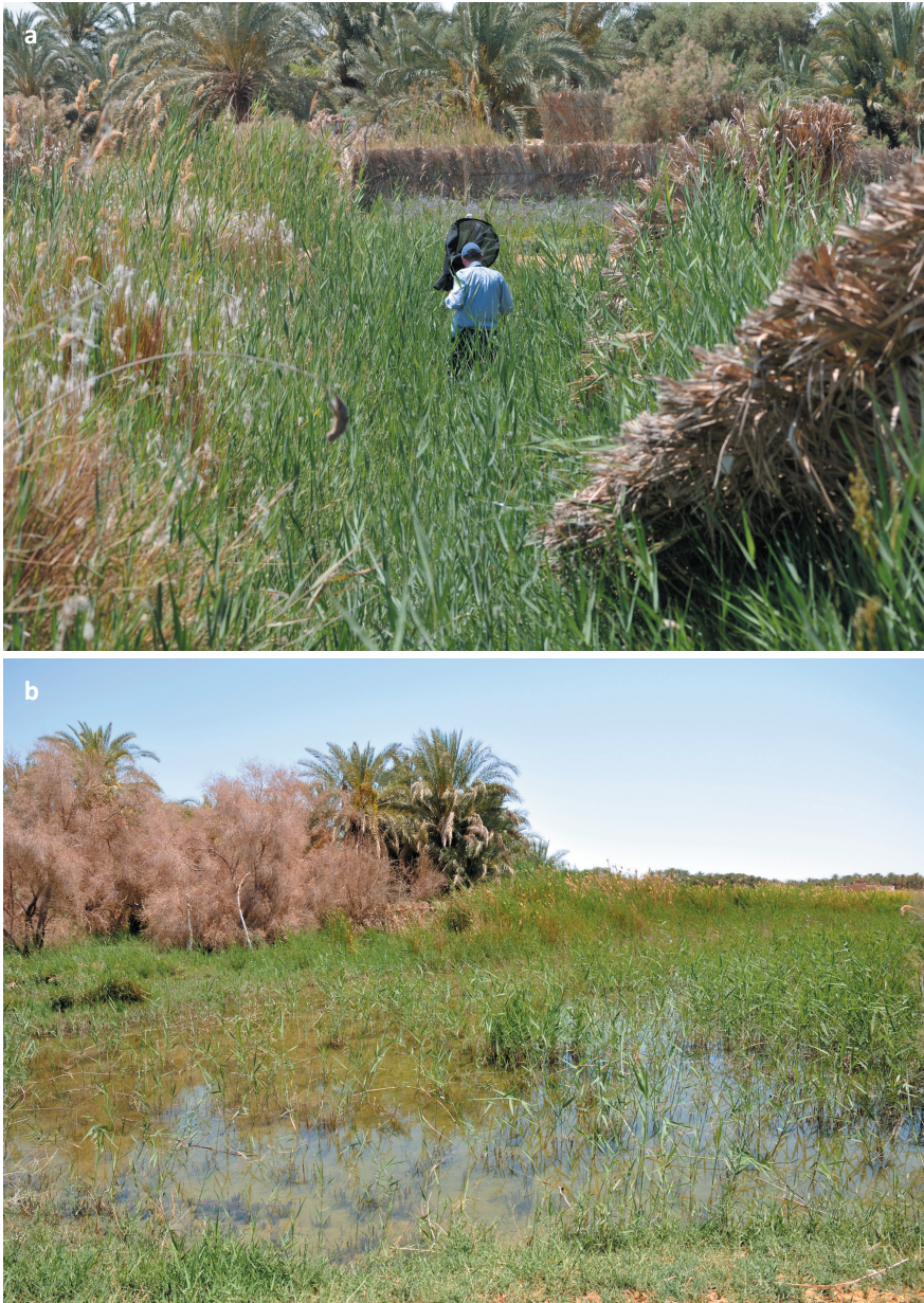
Figure 6a and 6b: Habitat of Orthetrum machadoi in the Siwa Oasis, Egypt (12-13-v-2009). – Abbildung 6a und 6b: Habitat von Orthetrum machadoi in der Oase Siwa, Ägypten (12./13.05.2009).