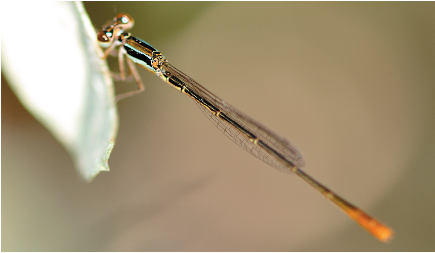
Figure 2: Agriocnemis sania, male, Lake Idku (Buhairat Idkū), Egypt (10-v-2009). – Abbildung 2: Agriocnemis sania, Männchen, Idku-See (Buhairat Idkū), Ägypten (10.05.2009).