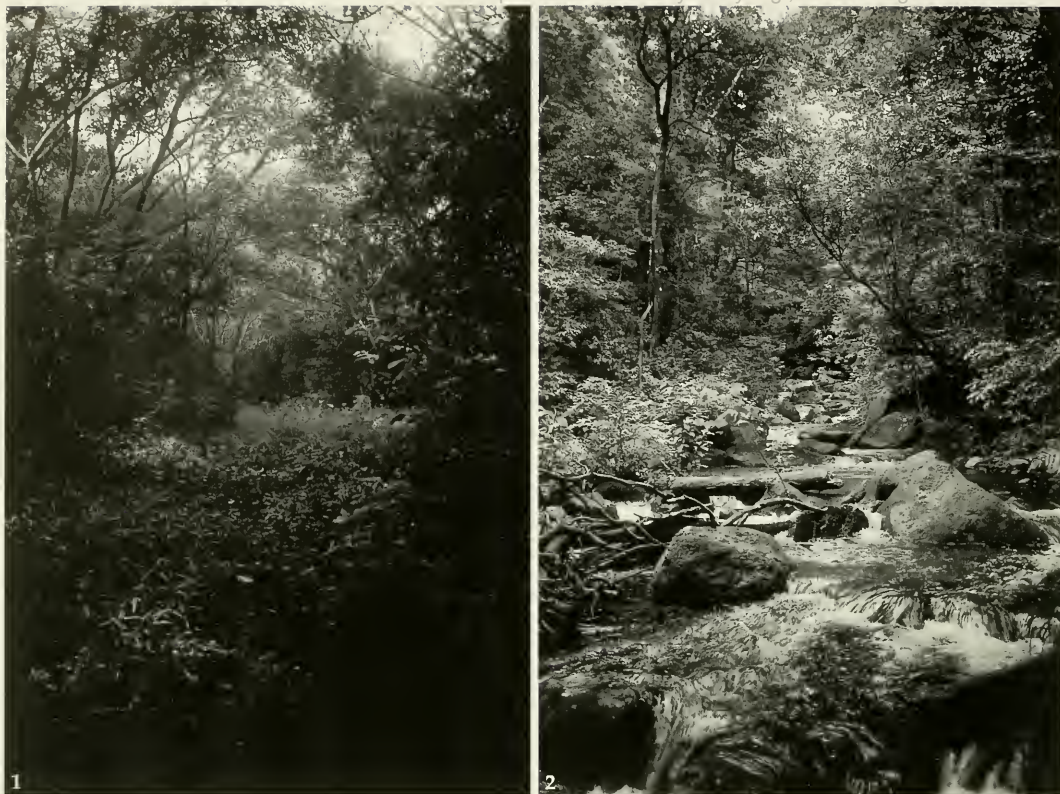
Fig. 1. Trail through secondary growth (formerly Tropical Moist Forest – TMF) south of Maritza Biological Station, 600 m a.s.l. Habitat of Ctenostoma maculicorne and Odontocheila nicaraguensis .