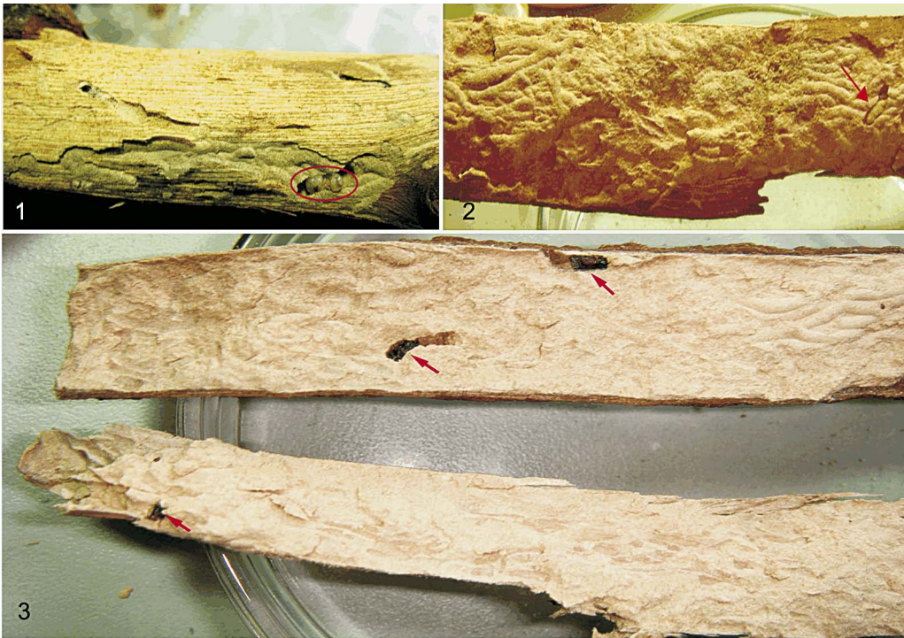
Figs 1-3: Fig. 1. Galleries of Xylopsocus bicuspis with a larva at the right bottom (in circle) (debarked branch). Fig. 2. The branch attacked by Xylopsocus bicuspis , arrow points out a pupa (debarked branch). Fig. 3. Split branches heavily attacked by Xylopsocus bicuspis , arrows point out three adults.