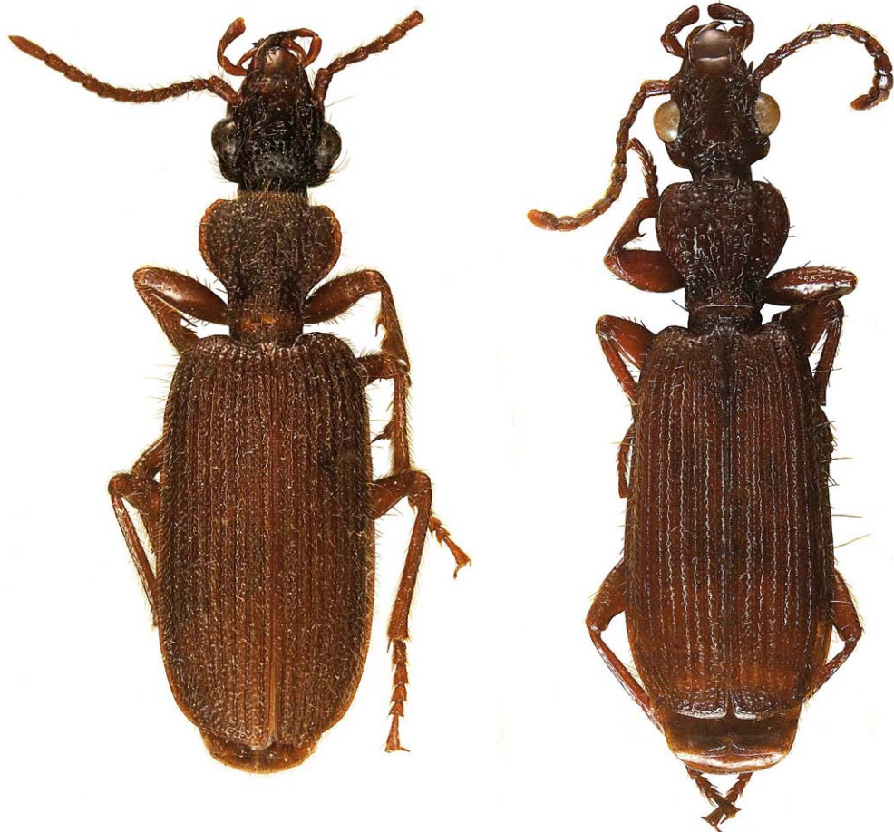
Figs 2-3. Habitus. Body lengths in brackets. 2 (left): H. kalumburu sp. n. (11.6 mm). 3 (right): H. bisetosum sp. n. (10.9 mm).