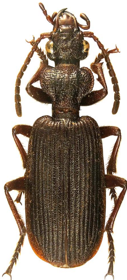
Figs 1. Habitus. Body lengths in brackets. Helluosoma crenulicolle sp. n. (16.4 mm).

Measurements were taken using a stereo microscope with an ocular micrometer. Body length was measured from apex of labrum to apex of elytra, length of pronotum along midline, length of elytra in a straight line from the most produced part of the humerus to the most produced part of the apex.