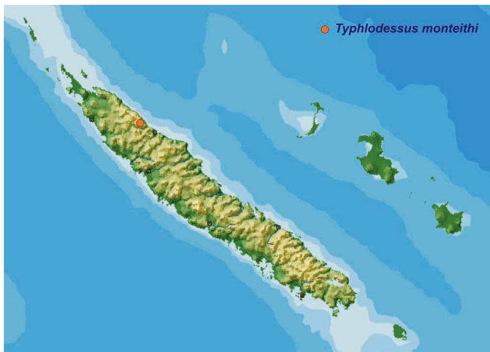
Fig. 6: Map of New Caledonia indicating the type locality of Typhlodessus monteithi .

DISTRIBUTION (Fig. 6): Known only from the type locality.