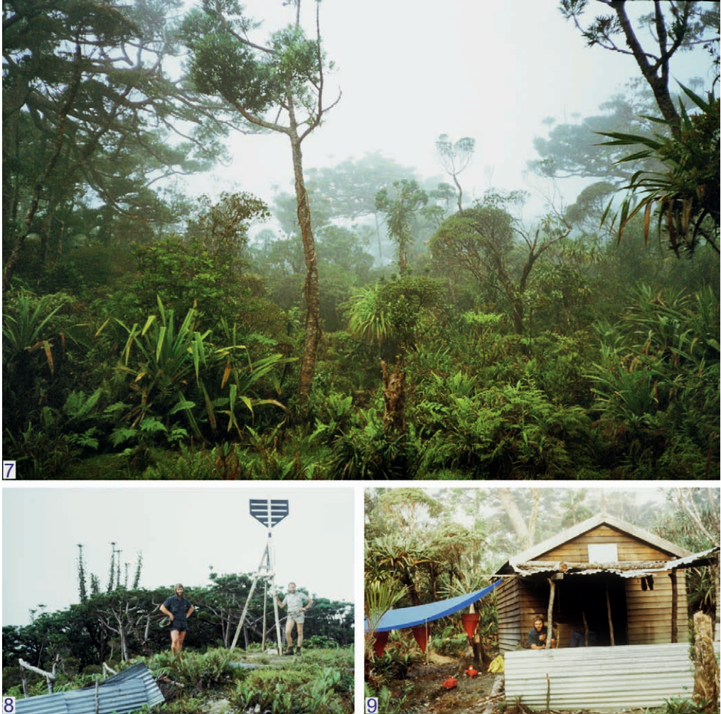
Figs. 7–9: Mt. Panié; 7) high altitude wet palm and conifer forest above 1,300 m, special botanical reserve on the east face of the mountain; 8) Australian entomologists D. Cook (left) and G. Monteith on the summit (1,600 m), in May 1984; 9) refuge hut in May 1984 at the time when Typhlodessus monteithi was collected; on the left are the red funnels being used to extract insects from leaf litter collected in the red bags on the ground; D. Cook is waiting to process the samples.