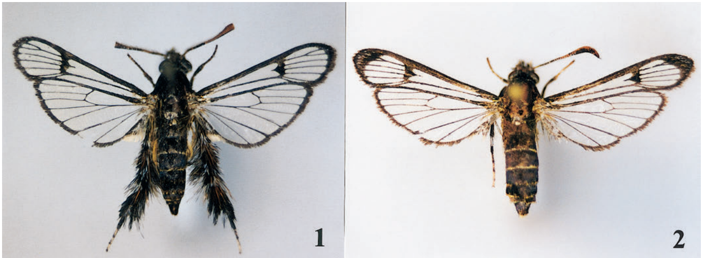
Figs. 1–2: Macroscelisia aritai spec. nov., Java. Fig. 1: ♂, holotype. Fig. 2: ♀, paratype.