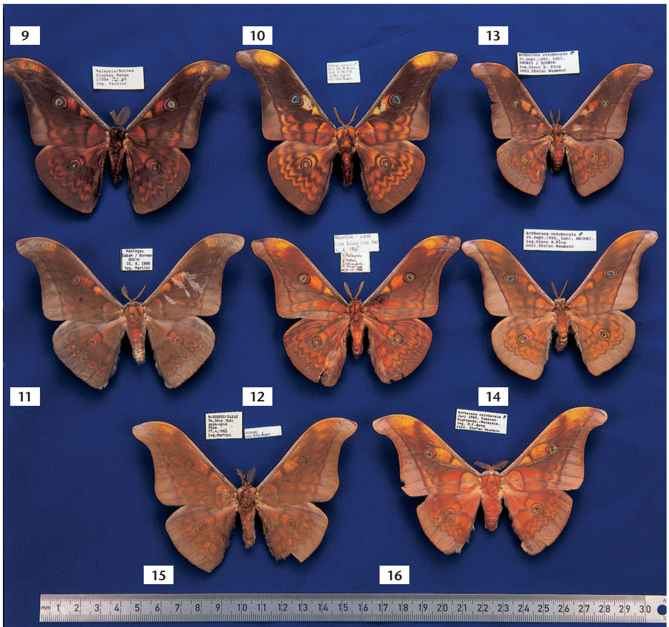
Colour plate 2: Further Sundanian Antheraea , figured from dorsal side. Figs. 9–12: A. broschii spec. nov., ♂♂, paratypes, Sabah, Borneo. Figs. 13 & 14: A. broschii spec. nov. ♂♂ paratypes, Brunei, Borneo. Fig. 15: A. steineorum ♂, Sabah, Borneo. Fig. 16: A. broschii spec. nov. ♂, West Malaysia. — All figs. at the same scale. Photograph U. BROSCH.

ingly. The other paratypes with blue paratype labels: 2 ♂♂, same data as holotype (CSNB); 12 ♂♂, 1 ♀, same data as holotype (CSLL); 1 ♂, Kinabalu, Kian [Kiau?] Gap, 4. iv. 1986, via L. RACHELI, GP 487/00 SNB (CSNB); 1 ♂, Mt. Marapok, iv. 1993, leg. Marc DE RIDDER (CSNB); 1 ♂, Crocker Range, 1200 m, iii. 1994, leg. MARTINI (CSNB); 1 ♂, Kenin-gau, 800 m, 10. viii. 1986, leg. MARTINI (CSNB); 1 ♂, Crocker Range, 16 miles NW Keningau, 1400 m, 2.–26. iv. 1984, leg. S. NAGAI, ex coll. ARITA, via A. KALLIES, (CSNB); 1 ♂, Crocker Range, Mt. Alab, 1600 m, 15.–24. ii. 2000, leg. P. SPONA & R. ZENKER (CSLL); 3 ♂♂, Trus Madi, 1600 m, iv. 1997, leg. B. & C. MARTINI (CSNB); 1 ♂, Kinabalu Nat. Park, Headquarters area, 1560 m, sample Sat. 36, open area with mountain rainforest, 17. xi. 1989 at light, leg. M. J. & J. P. DUFFELS, GP 856/95 W. A. NÄSSIG (ZMA); 5 ♂♂, 1 ♀, Mt. Kinabalu, Eingang zum Nationalpark, 116° 32.688' E 06° 00.182' N [sic], 1509 m, 19.–28. iii. 2001, leg. S. LÖFFLER (CSLL).