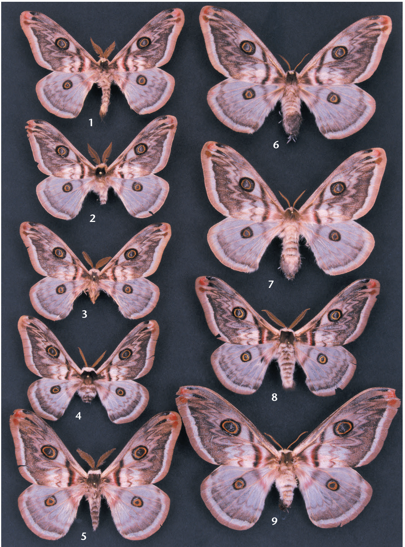
Colour plate, Figs. 1–9: dorsal view of Saturnia species. Fig. 1: Saturnia centralis , ♂ HT, China, West Yunnan. Fig. 2: S. centralis , ♂ PT, China, Sichuan (CSNB). Fig. 3: S. centralis , ♂ PT, NE Myanmar, Xingwei (CSNB). Fig. 4: S. cidosa , ♂, Nepal, Pokhara (CSNB). Fig. 5: S. cameronensis , ♂, West Malaysia, Cameron Highlands (CSNB). Fig. 6: S. centralis , ♀ PT, PR China, Sichuan (CSNB). Fig. 7: S. centralis , ♀ PT, NE Myanmar, Xingwei (CSNB). Fig. 8: S. centralis , ♂ PT, N. Thailand (CSLL). Fig. 9: S. cameronensis , ♀, West Malaysia, Cameron Highlands (CSNB). — All specimens to the same scale.