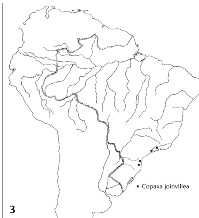
Fig. 3: Geographical distribution of Copaxa joinvillea in Brazil.

The ♀ of C. joinvillea is easily distinguished from C. flavobrunnea and C. canella by its yellow, instead of brown or fawn colored, ground color of the wings and body; by its fore- and hindwings with postmedial area darker than the antemedial, and by the dark and well-marked veins on forewing.