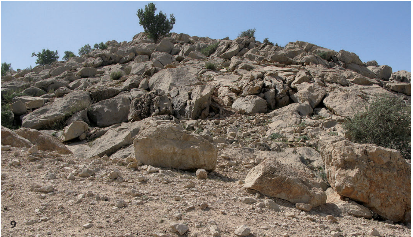
Fig. 9: Type locality in the vicinity of Ilam, Khuzestan.

it differs from the latter mainly in its smaller size and structures such as its stouter antennae (OBRAZTSOV 1966, DE FREINA 1989).