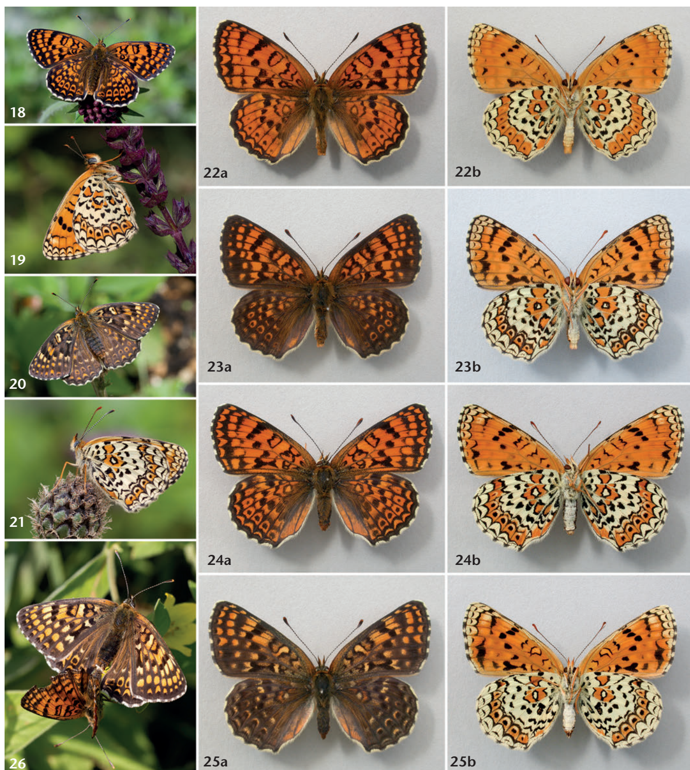
Melitaea arduinna from Serbia, Stara Planina region. Figs. 18–19: Adult ♂, ex ovo, 31. v. 2011. Figs. 20–21: Adult ♀, ex ovo, 7. vi. 2011. Figs. 22–25: Adult set specimens; a = upperside, b = underside. Fig. 22: ♂, ex ovo, 29. v. 2011. Fig. 23: ♂, ex ovo, 6. vi. 2011. Fig. 24: ♀, ex ovo, 10. vi. 2011. Fig. 25: ♀, ex ovo, 14. vi. 2011. Fig. 26: ♂ & ♀ in copula, 4. vii. 2011. All specimens to be donated to the Oxford University (Hope Department), Entomological collections, at Parks Road, Oxford OX1 3PW, U.K.

The larvae were only just emerging from hibernation and judging by their size were in their 3rd instar. Fresh frass was observed beneath the new leaves of what appeared to be a species of Centaurea . The larvae were black with small grey speckles covering each segment, resembling post-hibernating larvae of E. aurinia (Fig. 3). Further webs were found within a 200-m radius. The larvae from several of these webs were small and massed together while those from other webs, particularly lower down